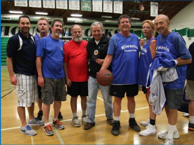
Moorpark Kiwanis at the 2016 Give Back Game with Thousand Oaks Kiwanis.