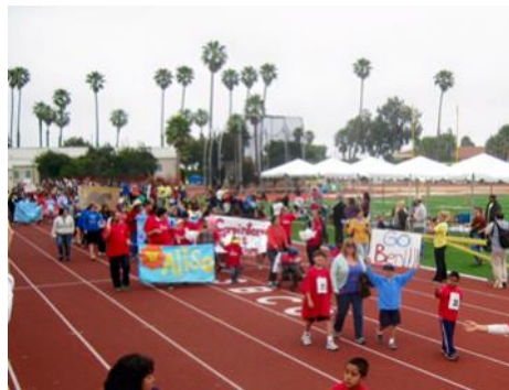
Kiwanis Club of Santa Barbara members were at SBCC this month to help and to support the 350 Special Olympics athletes at the School Day Games on April 22.