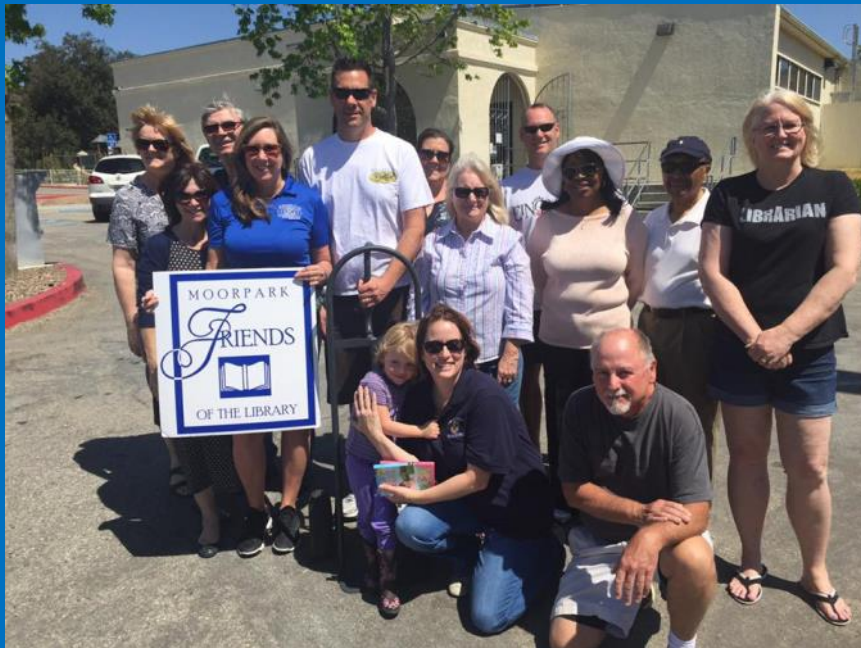
Moorpark Kiwanis had a great service project helping the Friends of the Library sort, organize, and transport books at their annual parking lot sale.