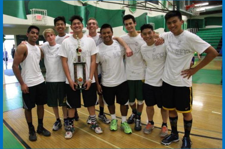
Moorpark Key Club wins again!!!