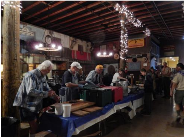
The serving team prepares to feed the many waiting Boy Scouts, leaders and parents.