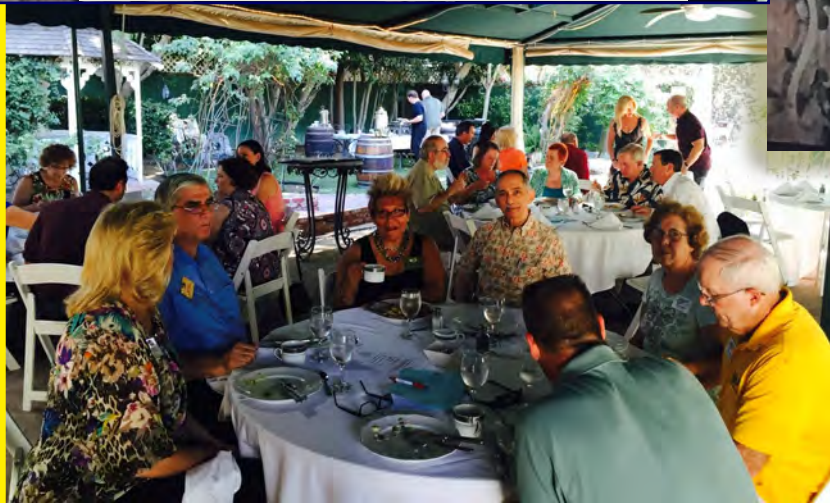
LEFT: Installation Brunch at the Secret Garden Restaurant in Moorpark