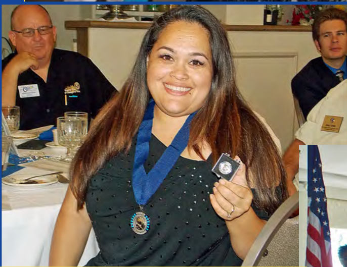
Lt. Governor Nick's Groupies ready to rock out!