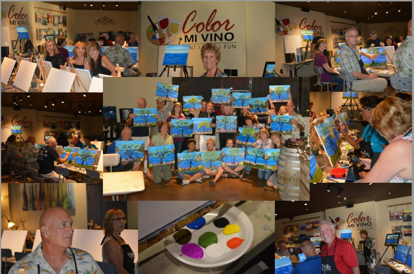
Cal - Nev - Ha District Convention: Las Vegas Some of our members and friends enjoying good times together.

Our monthly social outing for August was at Color Mi Vino . We "brushed up" on our painting skills while enjoying wine, snacks, and fun with friends.