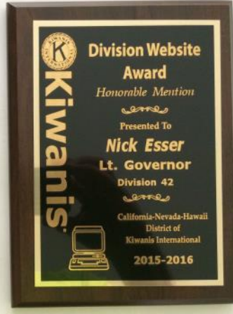
Division 42 Awards