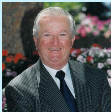
Governor Designate Pete Edwards