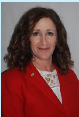
Governor Elect Designate Joni Ackerman