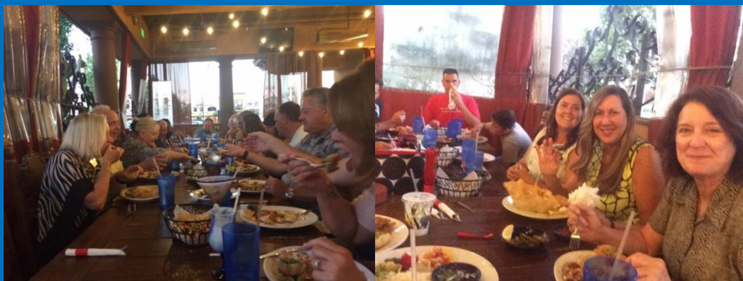
Our monthly social meeting was held at Don Cuco's in Moorpark. Our group was so big we took up half the patio!