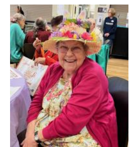
We served our traditional free Easter Breakfast of eggs, bacon, sausage, pancakes, and fruit at the Senior Center. This year included live entertainment – and a visit by the Easter Bunny, of course. Easter bonnets were encouraged!