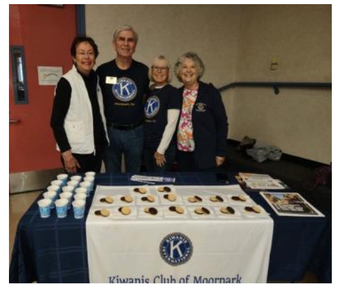
Moorpark has TERRIFIC Kids and TERRIFIC Kiwanians!