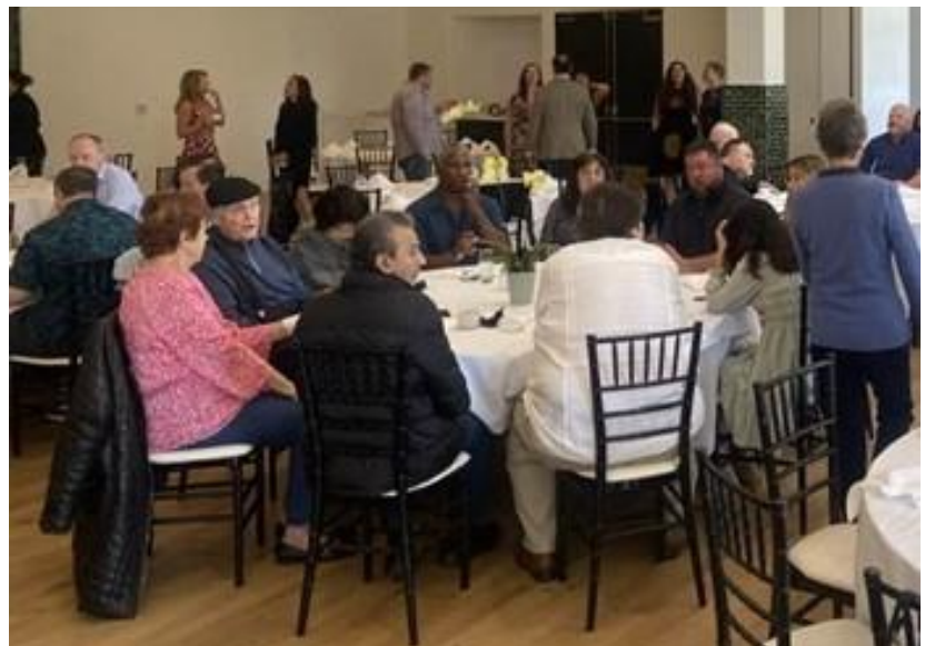
Kiwanis Family enjoying the party and making new friends