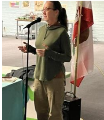
DCM Program by Corey