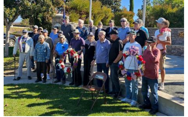
On Veterans Day, Moorpark Kiwanis members served veterans and guests at the commemoration ceremony.