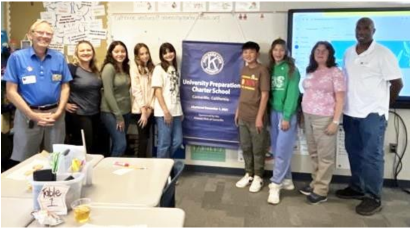
Builders Club installation of officers