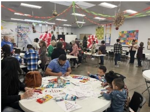
Christmas party for GLAD kids