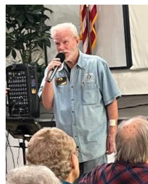
Karaoke! Our November social had members and guests enjoying a wonderful evening crooning their favorite tunes.