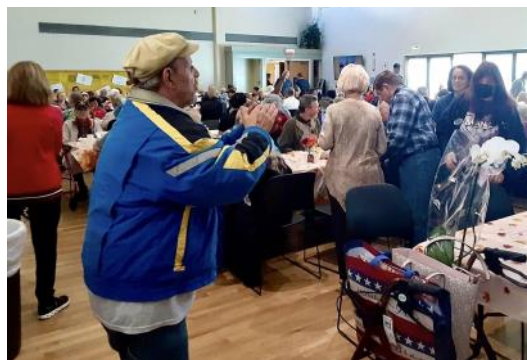
Simi Valley and Santa Su Kiwanis had a great time helping to serve a "Friendsgiving Luncheon" at the Senior Center. There were definitely some moves going on to the music, and the pumpkin dump cake with whip cream was divine!