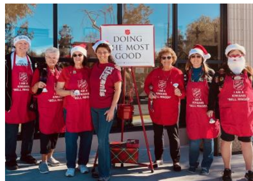
Happy Holidays! Simi Kiwanians caroled at Vista and Varenita Senior Living— joined there by many kids from our Builders Clubs. The following weekend, members rang bells for the Salvation Army in front of Hobby Lobby.