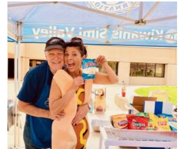
We rolled our ChuckWagon to the Simi Library for Reading Across America, selling hot dogs and chips to families.