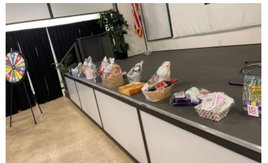
Members and guests gathered for food, fun, and prizes at our LCR Admin Fundraiser