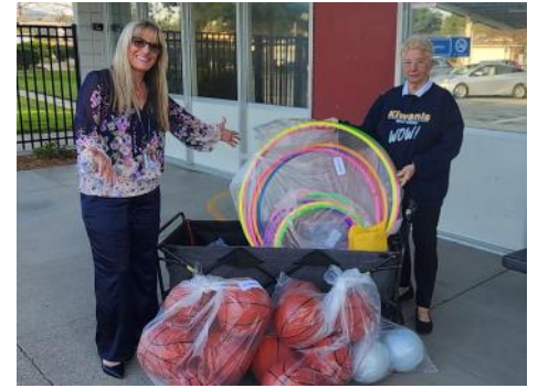
Simi Kiwanis is donating P.E. equipment to our elementary schools. The first are Township, Parkview, and Sycamore.