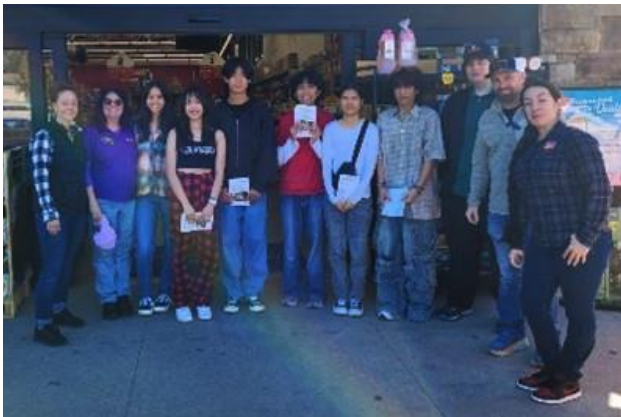
Great support from KIWIN'S and the store employees

We held our first Food Drive of 2024, where we set-up outside the Grocery Outlet in Camarillo and handed a list of items to shoppers as they entered the store. These were items that the local Food Pantry was desperate for, as their stocks have been drained by hundreds of residents who are struggling to make ends meet. We ended up filling 8 shopping carts that filled both the bed and cab of their truck. Our relationship with the Grocery Outlet has generated much interest at corporate level; they sent a representative to see how this event not only helps the community, but is a big win for the store as we must have collected about $2,000 worth of goods, plus some small donations of cash.