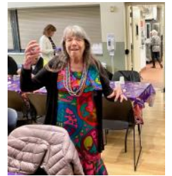
It was heartwarming to see Kiwanis and others spread joy and help celebrate Mardi Gras at the Senior Center.