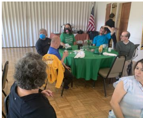
The Ventura AKtion Cub visits Ventura Kiwanis every month.