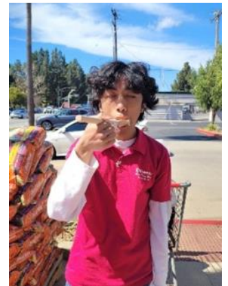
Ice cream break-wood spoon!