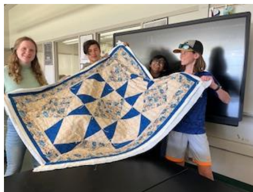
The "Busy Builders Club Bees" at Data Middle School work on this year's quilts for chemo patients in Ventura.