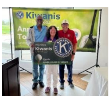
Another winning team