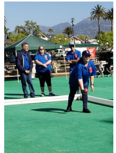
The Kiwanis club of Santa Barbara volunteered for the Special Olympics bocce ball tournament. Members of the Aktion club participated.