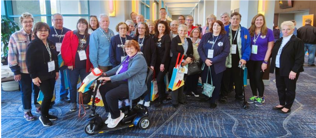
Division 42 stands out at the 2023 Midyear South Education Conference!