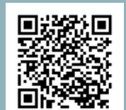
Bert Shoemaker Award

Nathan Hale Award - awarded to an individual who has performed an act of courage and/or personal involvement beyond the ordinary call of a citizen's responsibility.