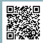
Nathan Hale Award

Special Olympics Athlete of the Year Award - awarded to a Special Olympics athlete who best exemplifies the Special Olympics motto: "Please help me win, but if I cannot, let me be brave in the attempt."