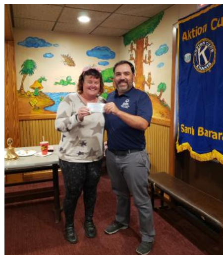
The Aktion club of Santa Barbara presents a donation to the Parks and Recreation department to sponsor the spring fling dance. They also presented a donation to Special Olympics for the polar plunge fundraising event.