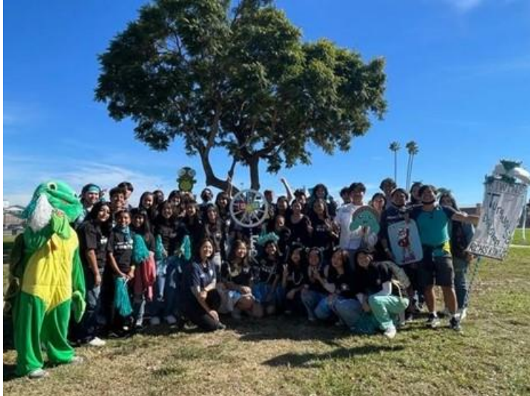
Turquoise Div. KIWIN's at their Fall Rally

In November our SLP's were very busy, as the KIWIN'S held their Fall Rally at Knotts Berry Farm, and the Key Clubs held their Fall Rally at Magic Mountain. The KIWIN'S Turquoise Div. came in first with their cheer and won the Spirit Award, and The Div.42W Key Club placed third in their section. Great to see so much spirit from some very enthusiastic SLPs.