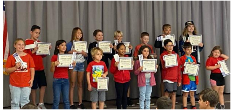
Moorpark has TERRIFIC Kids!