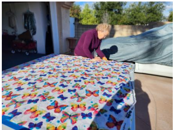
Gary and Karen work at cutting material for our No-Sew Blanket Program.