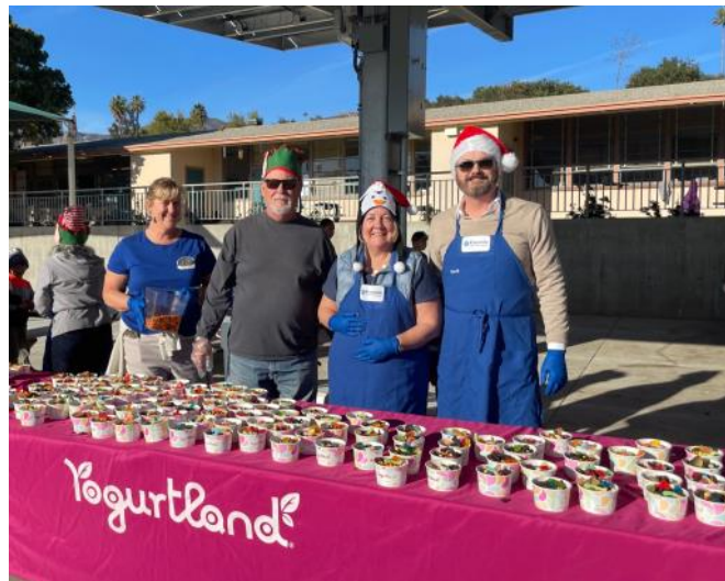
On Friday Dec 9th, Santa Barbara Kiwanians served treats to the 4th, 5th and sixth graders at Cleveland School in recognition of the awards they earned bringing up their grades and demonstrating their good citizenship.