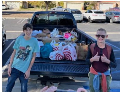
Campus Canyon Builders Club students collected over 600 food items for the Moorpark Food Pantry!