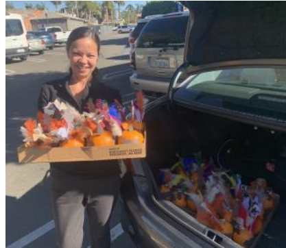
Ventura Kiwanis delivering pumpkin table decorations for the Salvation Army, Petit Ave. Thanksgiving dinner.