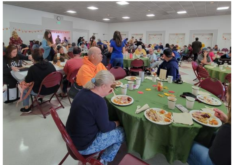
On Wednesday Nov 23rd, the Santa Barbara Club served a Thanksgiving meal to the developmentally disabled in our community.