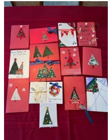
Our DATA Builders Club created Christmas cards for residents of a nursing home.