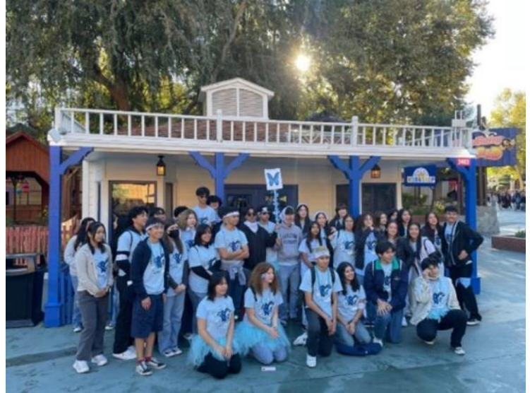
Div. 42W Key Clubbers at their Fall Rally

In December Camarillo Kiwanis, assisted by our KIWIN'S, helped to put on a Magical Christmas Party at kidSTREAM for children who are hearing-impaired. This is the first time we have teamed up with Tri County Greater Los Angeles on Deafness (TCGLAD) and we hope it becomes an annual event.