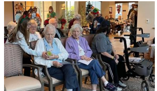
What fun it was to go caroling at Varenita Senior Living with two of our K-Kids clubs! We also passed out goodies to the residents attending. Afterwards, the kids were treated by Varenita with a hot cocoa bar!