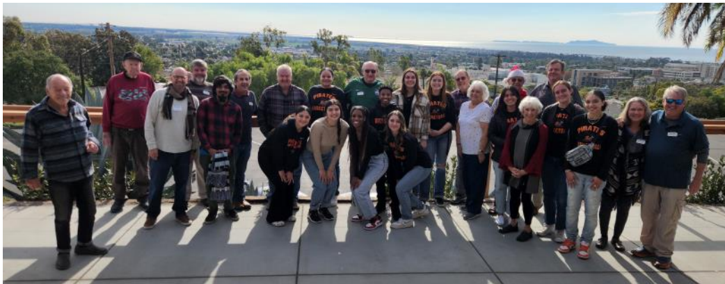
Ventura Kiwanis hosts the Ventura College Women's Basketball team in honor of their participation in the 2022 Kiwanis Basketball Tournament.