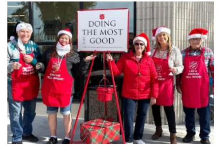
Simi Valley Kiwanis having fun "Ringing the Bells" for the Salvation Army!