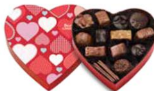
Be Mine Heart Milk and dark decadence. 8 oz $20.00 #507303