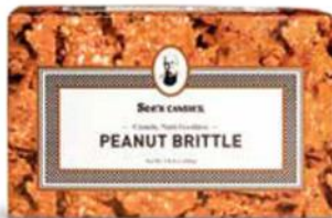
Peanut Brittle Buttery, crunchy and irresistible. 1 lb 8 oz $29.00 #500355