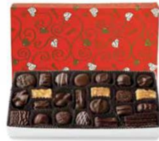
Dark Chocolates A taste of cacao in every bite. Delivered in seasonal wrap. 1 lb $29.00 #530330