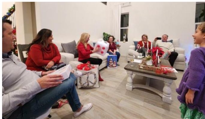
Our annual Holiday gathering was great—with friends, food, and a fun game!