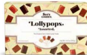
Assorted Lollipops Vanilla, Butterscotch, Café Latté and Chocolate. Approximately 30 lollipops. 1 lb 5 oz $28.50 #500296