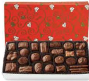
Milk Chocolates Pure milk chocolate goodness. Delivered in seasonal wrap. 1 lb $29.00 #530326