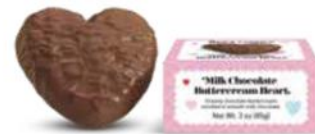
Milk Chocolate Buttercream Heart Milk chocolate deliciousness. 3 oz $8.00 #507958