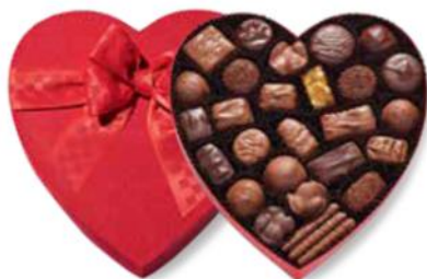
Classic Red Heart Assorted Chocolates Full of See's favorites. 1 lb $38.00 #503188