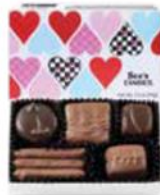
Mini Hearts Box A rich mix of See's bestsellers. 3.5 oz $11.00 #503185