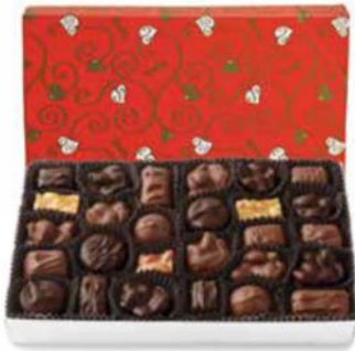
Nuts & Chews Yummy, crunchy and chewy. Delivered in seasonal wrap. 1 lb $29.00 #530334