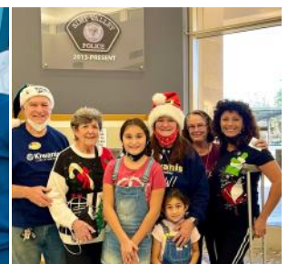
Venturing out to deliver holiday goodies to our First Responders in Simi Valley. Thanking them for their service in keeping our community safe!