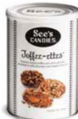
Toffee-ettes* Crunchy toffee, milk chocolate and almonds. 1 lb $29.00 #500316