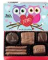
Mini Valentine's Owls Assortment A rich mix of See's bestsellers. 3.5 oz $11.00 #507963