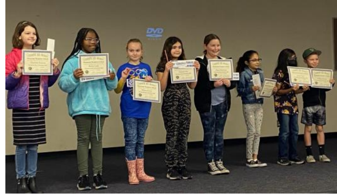
Moorpark has TERRIFIC Kids!