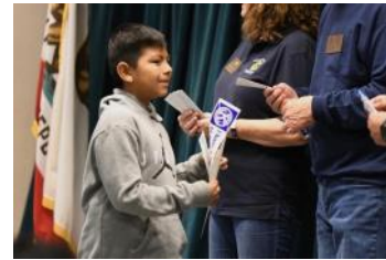
The TERRIFIC Kids program in Moorpark is a success at all our elementary schools!