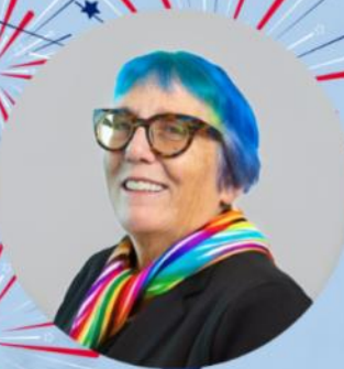
CAROLE FARRIS IMMEDIATE PAST GOVERNOR