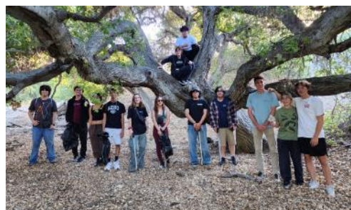
During September, our Circle K Club at Moorpark College worked on trail cleanups for the Rancho Simi park district.