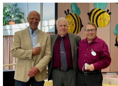
SLP youth advisors and Aktion Club advisors are honored; Membership Committee is recognized.