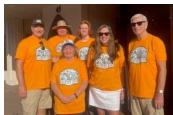
Moorpark Kiwanians and friends volunteered at the annual Country Days parade!