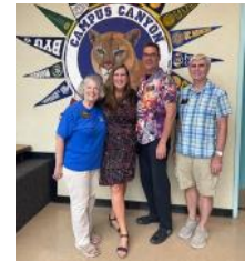
Our Builders Club is up and running with new officers and a large club membership!