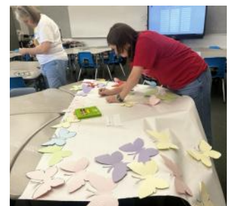
Data Builders Club works with Ventura Kiwanis members to create a thank you poster for their teachers. The poster features butterflies and says "Thank You For Helping Find Our Wings."