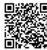
Bert Shoemaker Award