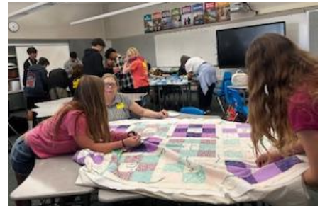
Ventura Kiwanis continues with its joint project with DATA Builders Club creating quilts for cancer patients.