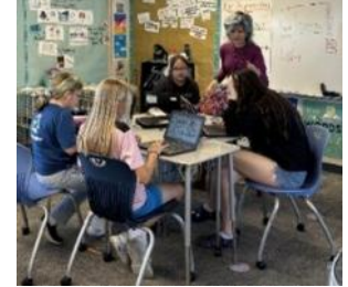
Builders Club members work on their two projects.

We set up an information booth at an event put on by the Recreation and Parks District to promote our activities. Two of our potential Aktion Club members came along to help. Sadly, due to another event in town, this one was poorly-attended.