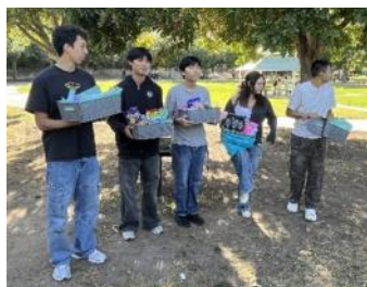
Seniors presented with gifts