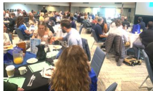
Ventura Kiwanis participated in the Ventura Chamber of Commerce monthly Connection Breakfast.