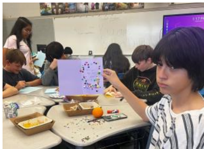
Data Builders Club sent attractive and creative cards to first responders - just because they could.