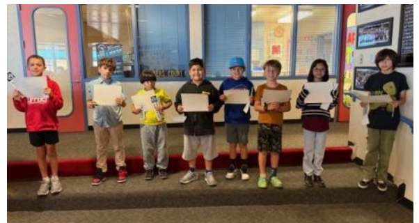
Moorpark has TERRIFIC Kids and TERRIFIC Kiwanians!