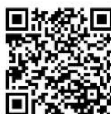
Nathan Hale Award