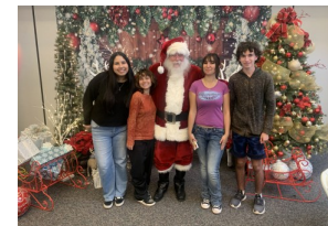
Ventura Kiwanis along with Thousand Oaks Kiwanis and the Ventura High School Key Club participated in the Ventura Suburban Kiwanis' Breakfast With Santa ceremony for children referred by the Ventura Salvation Army.