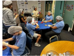
Builders Club students assemble sandwich and pack lunches for staff and day workers at the Moorpark Pantry Plus