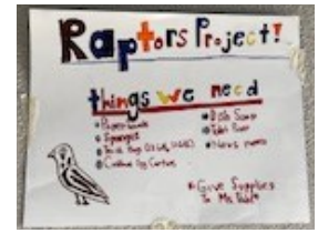
DATA Builders Club hard at work making posters for their two projects: canned goods for their food share donation tree, and gathering supplies for the Ojai Raptor Center