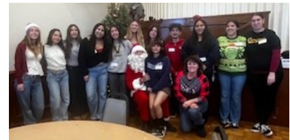
Ventura Kiwanis conducted its annual Holiday Party for Special Needs children of the Ventura Unified School District. This year 98 students attended. The Ventura High School Key Club and Aktion Club participated.