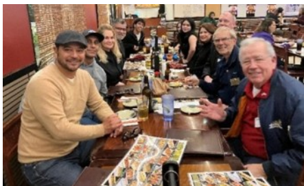
Oxnard Club Installation