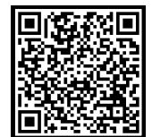
Key Club/KIWAN'S Scholarship App