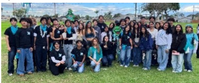
Turquoise Div. KIWIN'S