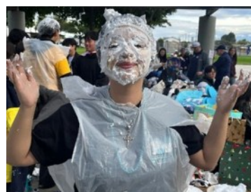
Who would be an LTG?