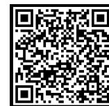
Circle K Scholarship App