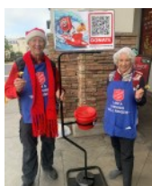
Ventura Kiwanis, together with Ventura Suburban Kiwanis, rang the Salvation Army bells for 2 days in front of Ralph's Grocery Store.