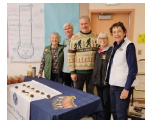
Every Friday, we honor students at TERRIFIC Kids ceremonies at all Moorpark elementary schools.