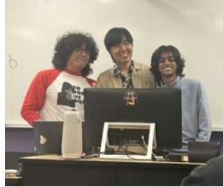
Moorpark Circle K