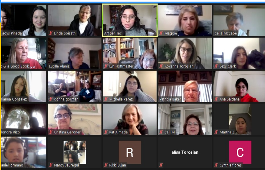
Participants of Soup and a Good Book

We gratefully thank all who made this event possible. “Hope For the New Year” was clearly demonstrated by everyone’s enthusiastic participation.