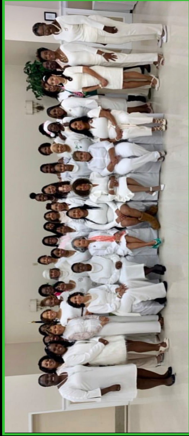
Alpha Kappa Alpha Sorority, Inc.® Epsilon Iota Omega Chapter Dover, DE