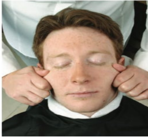
figure 12-5 Pétrissage.

Friction (FRIK-shun) is a deep rubbing movement in which pressure is applied on the skin with the fingers or palms while moving over an underlying structure. Friction has been proven to be beneficial to the circulation and glandular activity of the skin ( Figure 12-6 ).