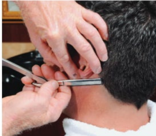
figure 13-11 Reverse-backhand stroke.

This evaluation is Straight Razor Shaving . 10 minutes will be provided to set up your workstation and prepare your client for a straight razor shave. You are required to steam the face with a towel, and lather the face for a shave. The proctor will announce when there are 5 minutes left to finish. When you complete your tasks, please stand quietly. Start your preparation, timing begins now.