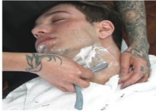
figure 13-10 Reverse-freehand position.

The movement is from the elbow to the hand with a slight twist of the wrist.