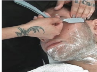
figure 13-9 Backhand position.

Direct the stroke with the point of the razor leading in a forward, gliding movement.