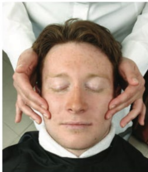
figure 12-6 Friction.