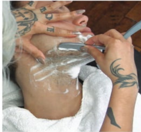
figure 13-8 Freehand position.