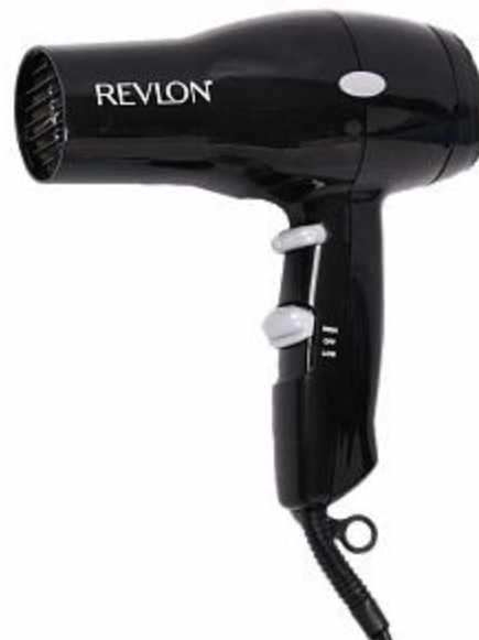
FIGURE 3 - REMOVE OLD KEYPAD USING HEAT GUN, CLEAN PLASTIC SURFACE THOROUGHLY