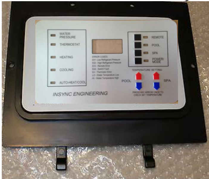
FIGURE 4 - PASTE ON NEW INSYNC KEYPAD, ALIGNING CONNECTOR THROUGH OPENING, AND MAKING SURE FEATURES IN THE PLASTIC ALSO LINE UP. IF YOU MAKE A MISTAKE, HEAT UP THE PANEL AND MOVE IT AROUND.