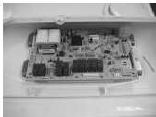
Figure 5-4 LED MODEL