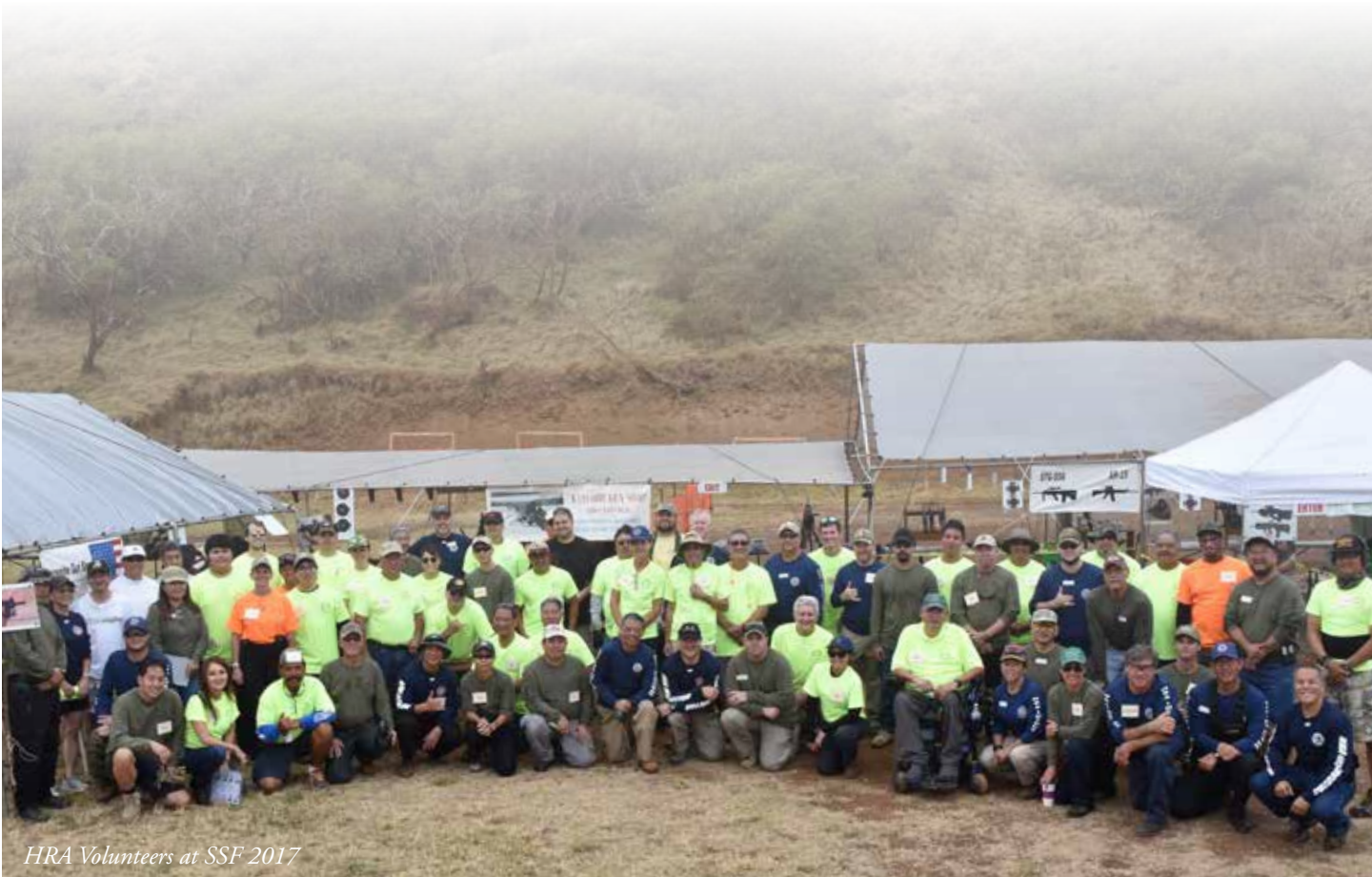
HRA Volunteers at SSF 2017

Protecting your Second Amendment Right to Keep and Bear Arms, and protecting Hawaii’s hunting and shooting traditions.