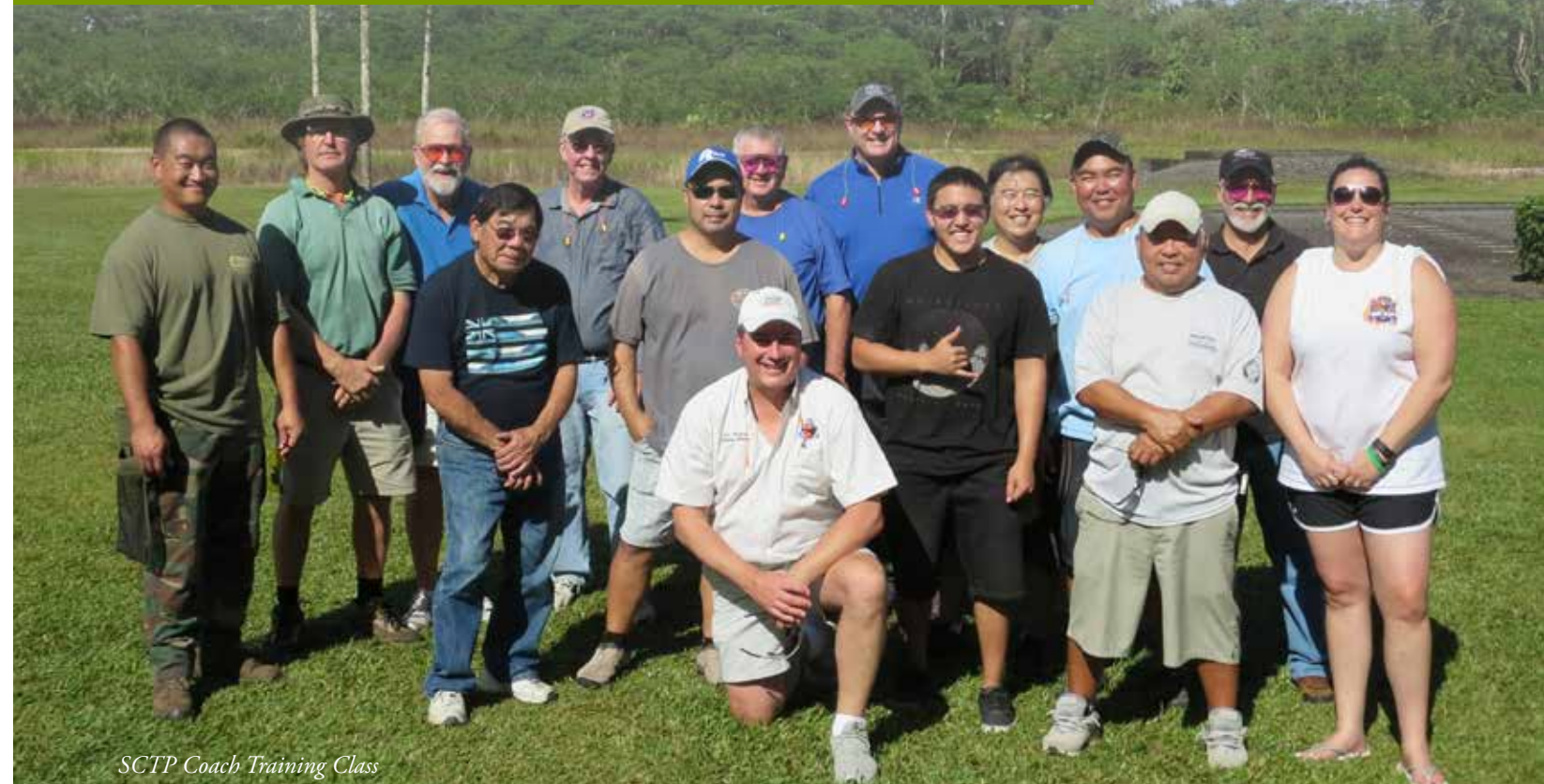
SCTP Coach Training Class

In a collaborative program with the County of Hawaii, On Target volunteer instructors have trained and certified nearly 200 residents in Basic Shotgun Shooting, in recreational Trap and Skeet Shooting, and as Range Safety Officers.