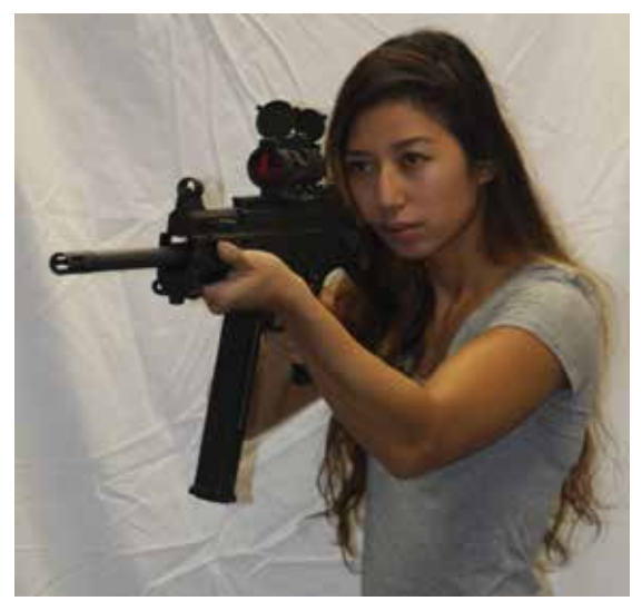
HK UMP .45acp