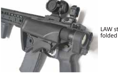
LAW stock closeup,