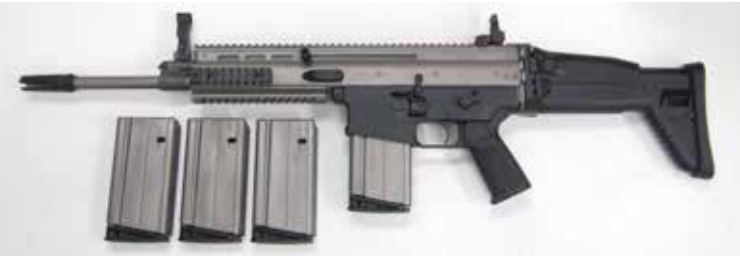
FN SCAR .308