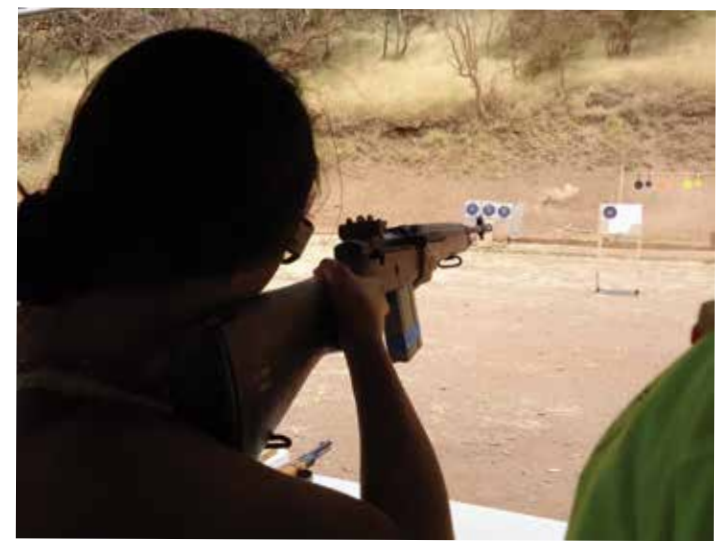
Springfield M1A .308