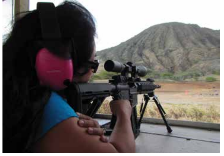
Scoped .22 caliber target rifles