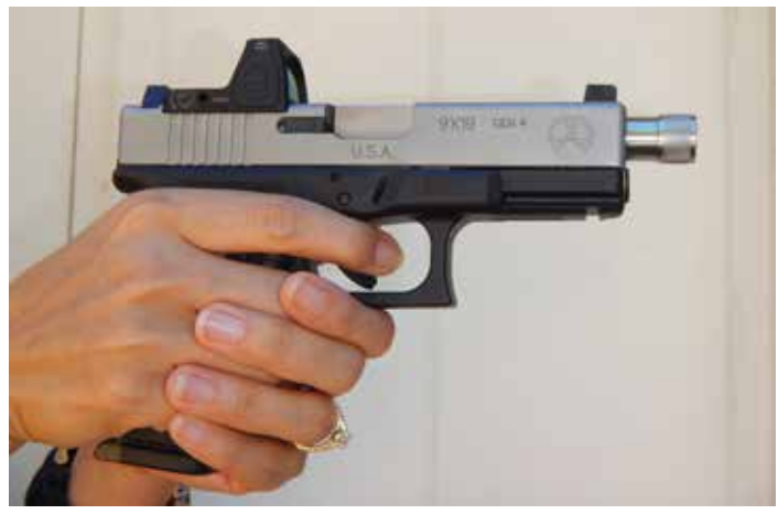
Glock with Trijicon RMR optic