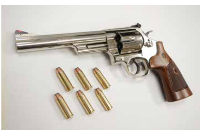
S&W Model 29 .44 Magnum