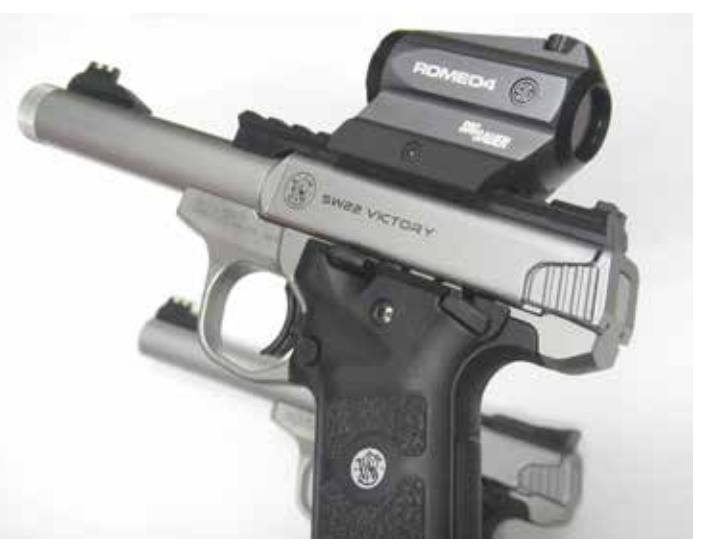
S&W Victory with Sig Romeo4 optic