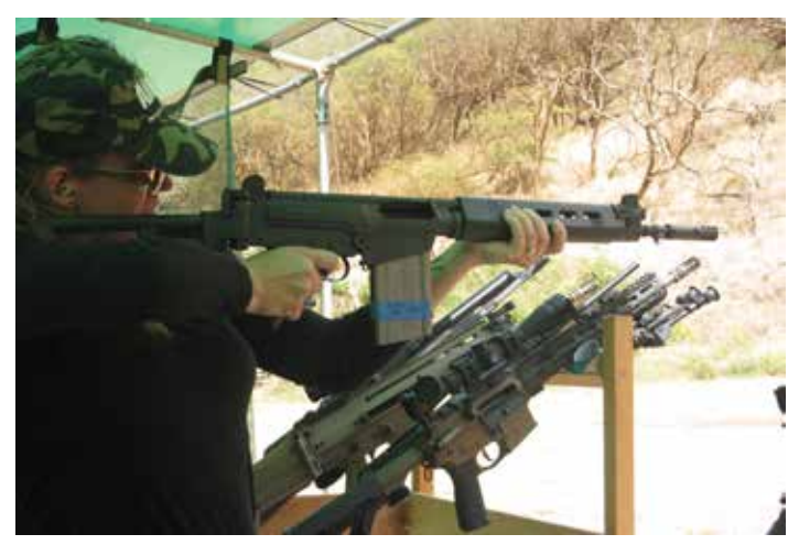
FN FAL .308