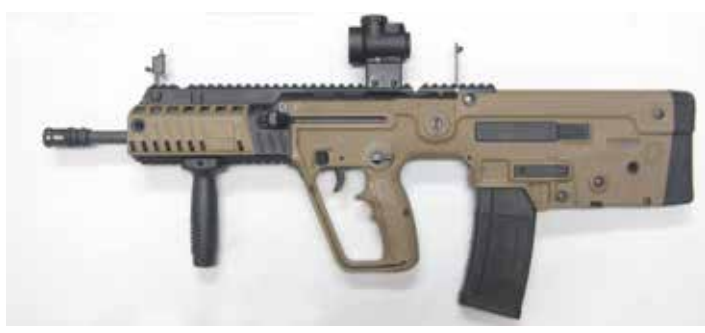
IWI X95 5.56