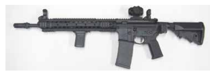
AAC 300 Blackout with LAW sidefolding stock

There is quite the lineup of firearms among the HRA shooting bays, Skeet Club and Rifle firing lines. Many of the newest, exciting firearms and accessories are available to be experienced each year, and there have always been numerous guns on the firing lines, which fairgoers remark they have never seen or have not been able to handle before this annual event.