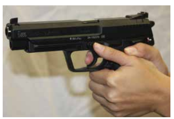
HK USP Expert 9mm