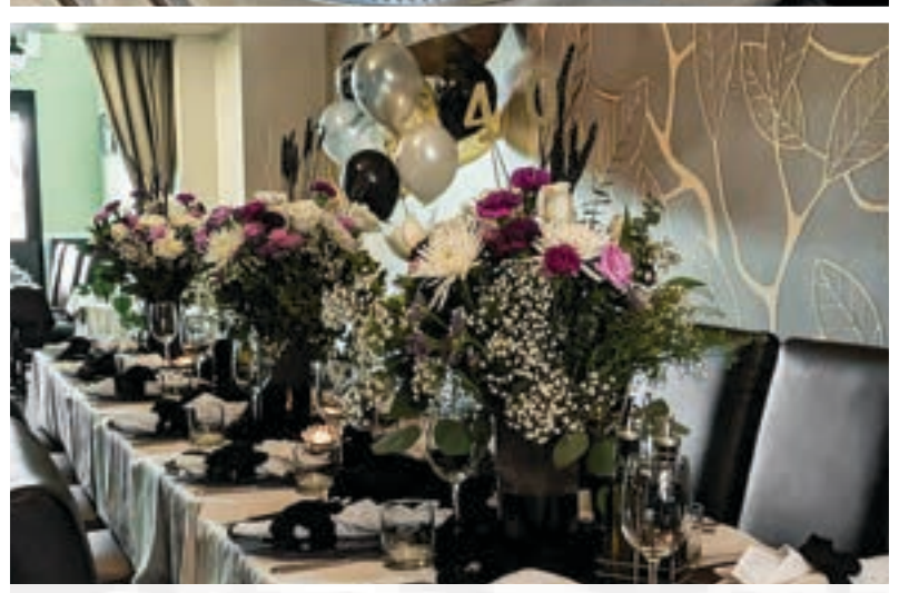
*All tables come with the standard table cloths, napkins, & candles free of charge.