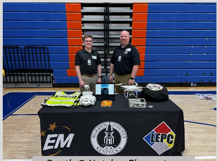
Booth @ Natcher Elementary Career Day