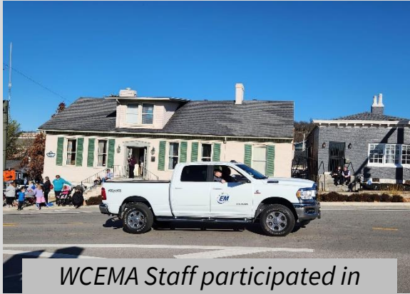
WCEMA Staff participated in Governor's Parade.

Below are just some of the pictures from the activities we participated in.