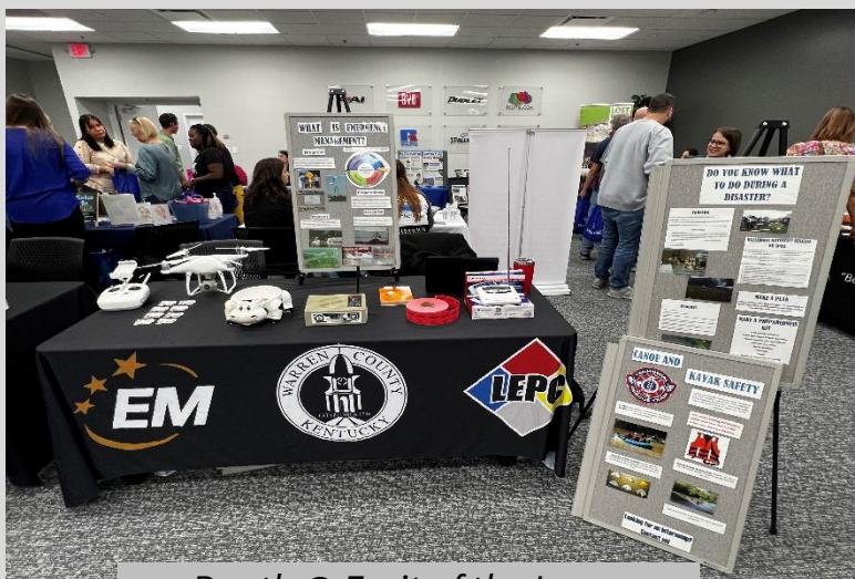
Booth @ Fruit of the Loom Employee Safety Day

If you would like to have our agency speak to your group or have a booth, feel free to call the office @ 270-781-8776. Below are just a two of the pictures from this past year.