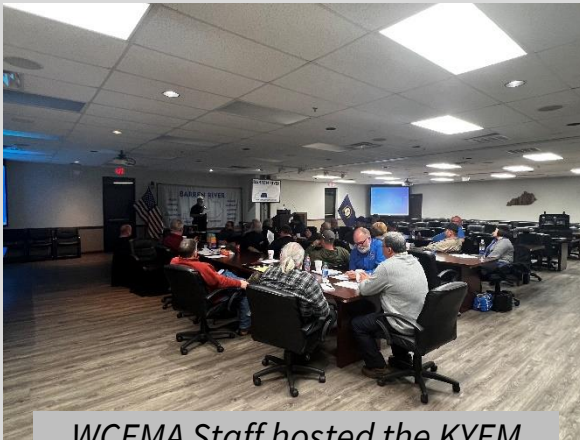
WCEMA Staff hosted the KYEM Area 3 meeting at BRADD.