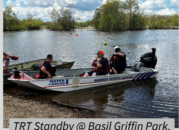
TRT Standby @ Basil Griffin Park.