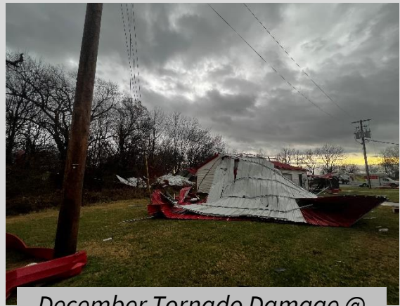
December Tornado Damage @ Cumberland Trace Super 8.