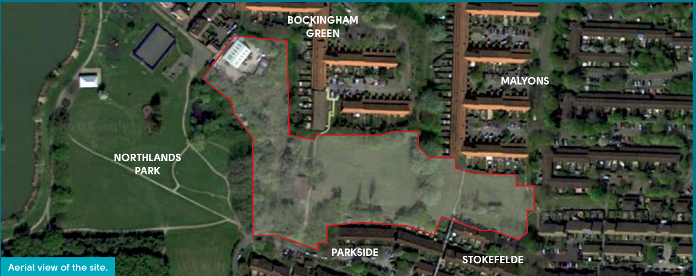
Aerial view of the site.

A second public consultation, about our detailed proposals, has now opened for you to have your say, with interactive events next week.