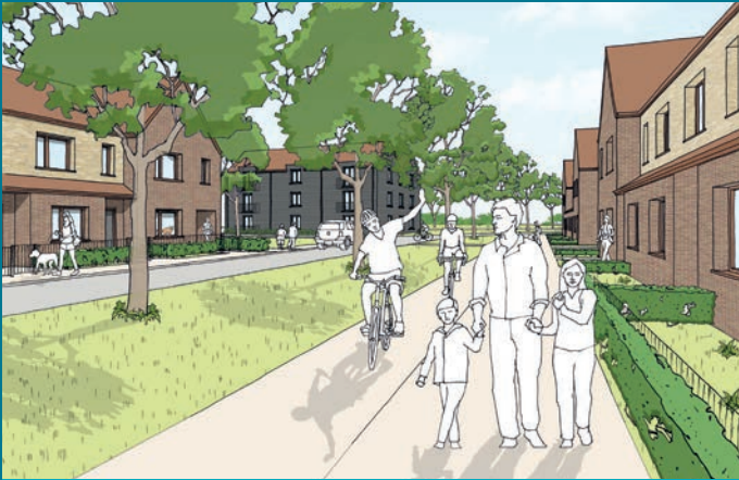
The new pedestrian route to/from Northlands Park.

Since holding the first public consultation in January, Sempra Homes has now developed detailed proposals for new homes at the land off Parkside.