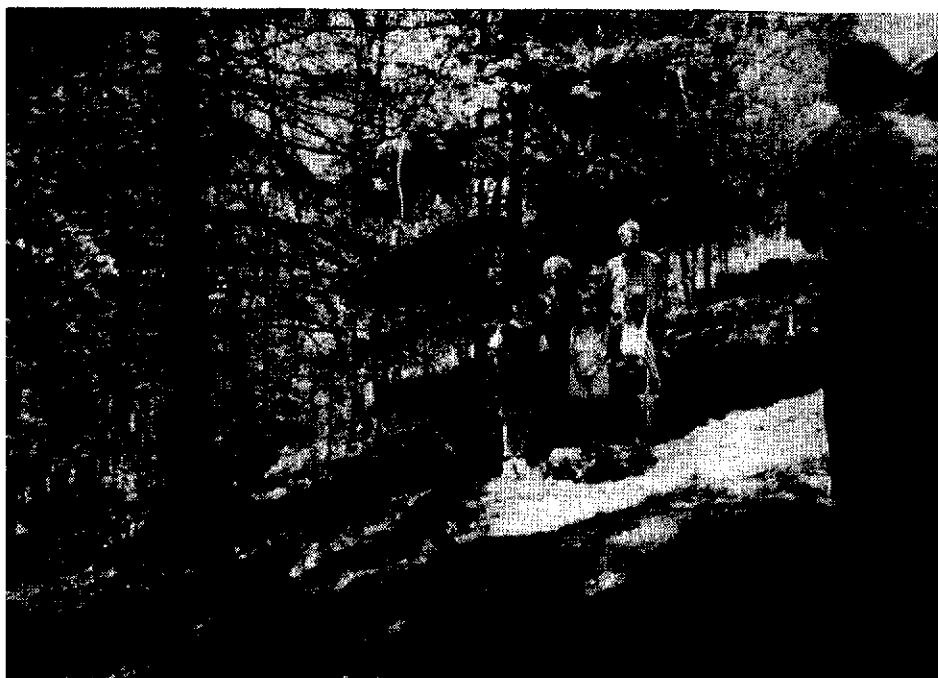
Decendants of Solomon Pontious: Front row Shawn Campbell, Dayna Campbell, Tera Harman. Back row: Pearl Fiedor, Cortez Harman.