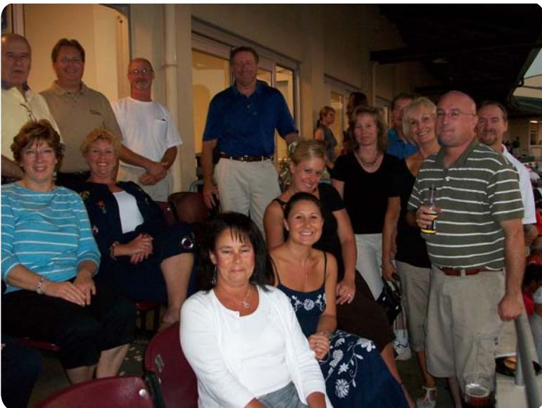
Dayton BOMA members and their guests enjoyed a rainy but pleasurable evening at the Dragons Stadium.

Some of the most "shocking" changes are the fact that to operate a circuit breaker on ANY panel requires the following: long pants, long sleeved shirt, safety glasses or safety goggles, hearing protection and leather gloves. The bottom line with the new code is "If it's not completely powered down, we are no longer allowed to work the circuit". The issue isn't just an individual circuit, it is the entire panel that houses the circuit and the panel's main feed.