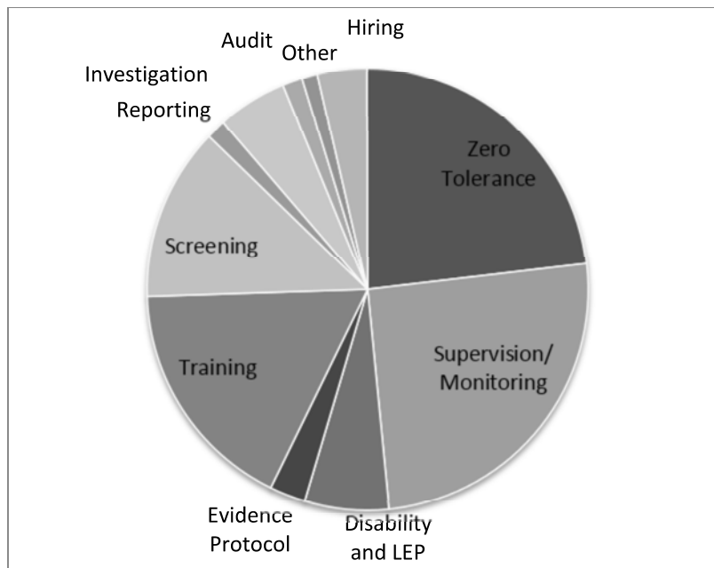
Table 14: Relative Cost of Full Nationwide Compliance with Various Standards

Again, these tables reflect the estimated costs of full nationwide compliance, which will occur only if all State, local, and private confinement facilities adopt the standards contained in the final rule and then immediately and fully implement them. In this sense, the cost impact of the final rule, as represented here, is essentially theoretical—in effect treating the standards as if they were binding regulations on State and local confinement facilities.