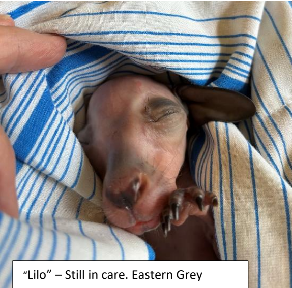
“Lilo” – Still in care. Eastern Grey

I have been wildlife caring for the best part of 15 years now and seem to learn something new with each animal that comes into my care. As most carers do, I started with brushtail possums, then started taking in ringtails, gliders, some birds, then moved more into what has become my absolute favourite animals to have in care, macropods.