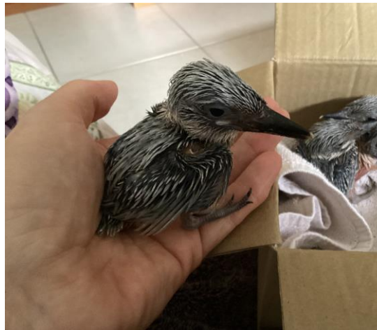
Sacred Kingfisher chicks