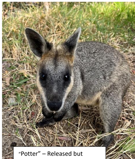
“Potter” – Released but visiting. Swamp wallaby.

It is important to keep in mind that without wonderful and dedicated carers like you all, these animals simply would not have a chance at life. The fact that you are willing to pour time, expenses, and love into these animals in need is absolutely amazing and you should be proud of what you are doing and the chance at life you have provided for the animals in your care.