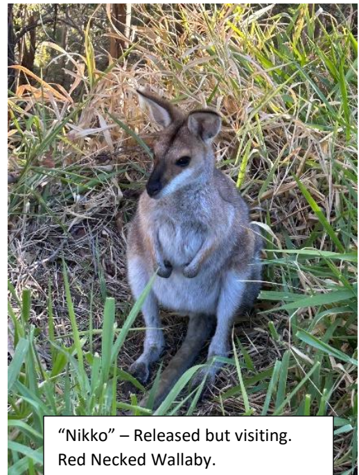
“Nikko” – Released but visiting. Red Necked Wallaby.

though, macropods caring can be immensely hard at times. The survival rate of macropod joeys reaching maturity in the wild is around 30%. And this is for the babies that can actually stay with their mums where they should be.