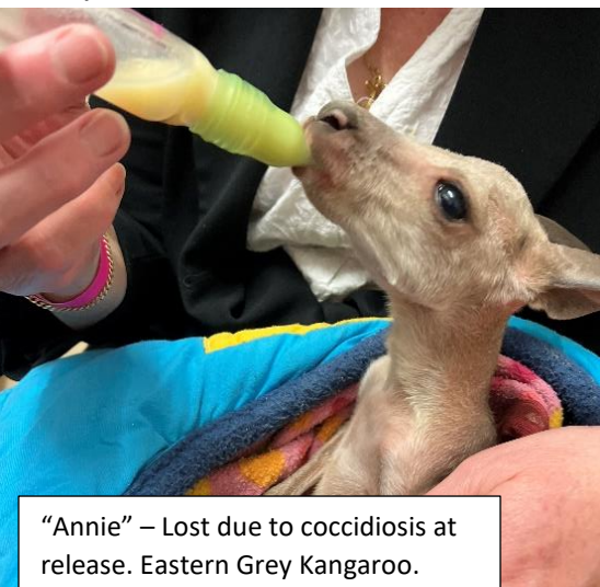
“Annie” – Lost due to coccidiosis at release. Eastern Grey Kangaroo.

There are a few things to keep in mind when being a macropod carer. The first of these is that these are wild