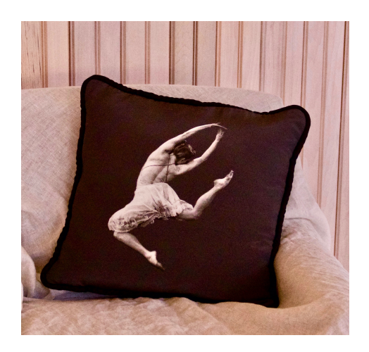
Pillow- rectangle or square - three sizes