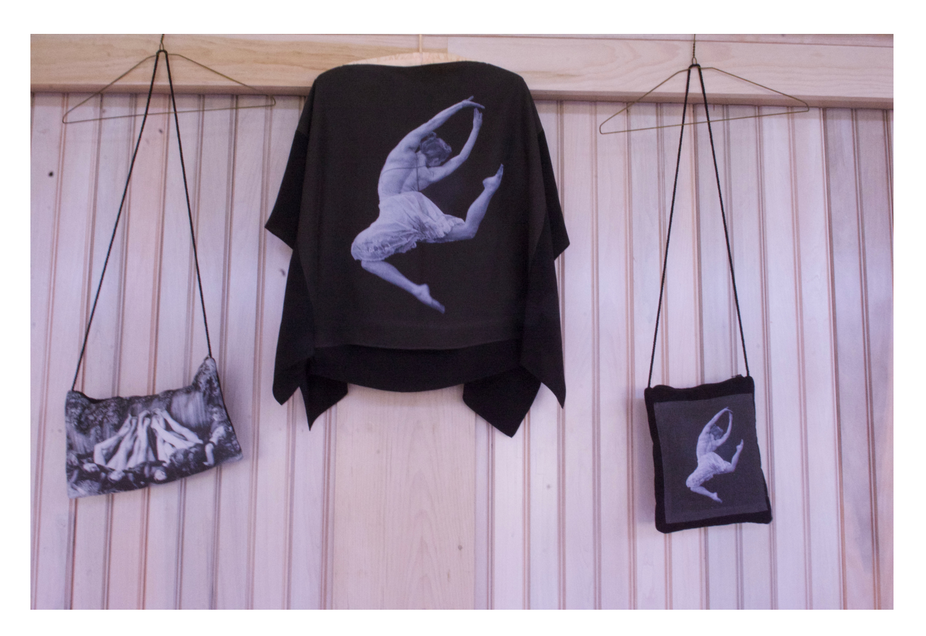
Handbag - 2 styles and sizes with flap or zipper