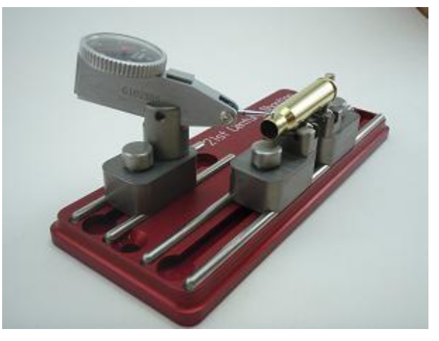
Figure 3 – OD Check Variations

Inside diameters may also be checked non-perpendicular or in-line. If you wish to check in-line, slide the gauge turret platform all the way to the left, removing it from the rear rail system. Insert on the front rail system and position so indicator stem can be placed in the case neck. (Figure 4)