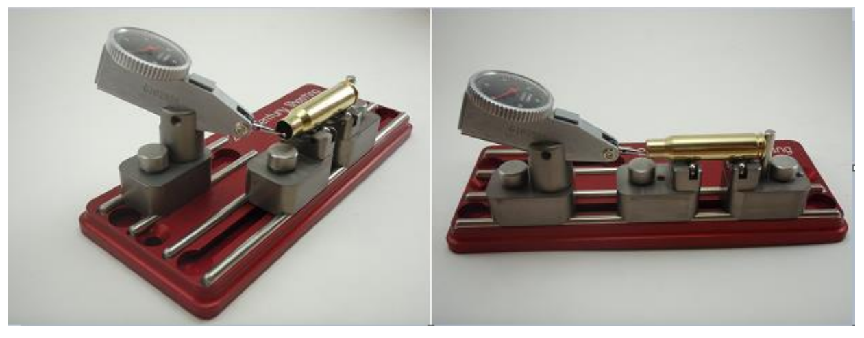
Figure 4 – ID Check Variations

• Roll the subject smoothly with even pressure throughout a complete rotation. Note movement of the needle on the dial. Each increment on the dial is .0005". The total travel of the needle in a single rotation of the subject equals the run out of the subject.