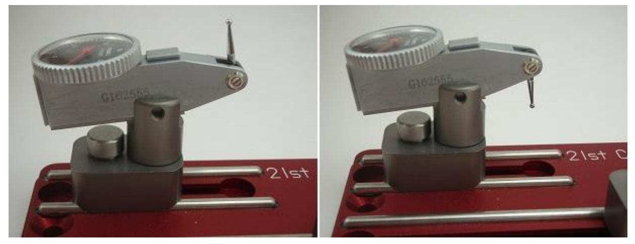
Figure 1 – Stem Travel