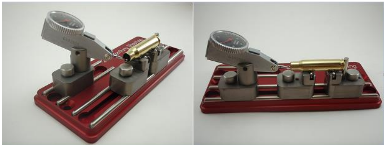
Figure 4 – ID Check Variations