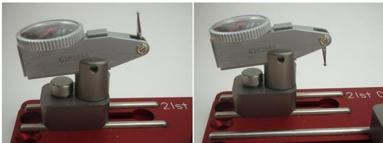
Figure 1 – Stem Travel