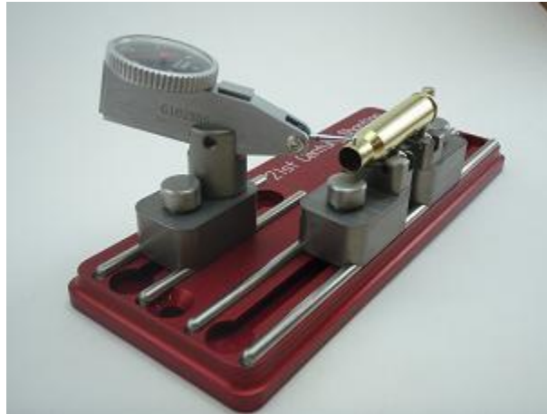
Figure 3 – OD Check Variations