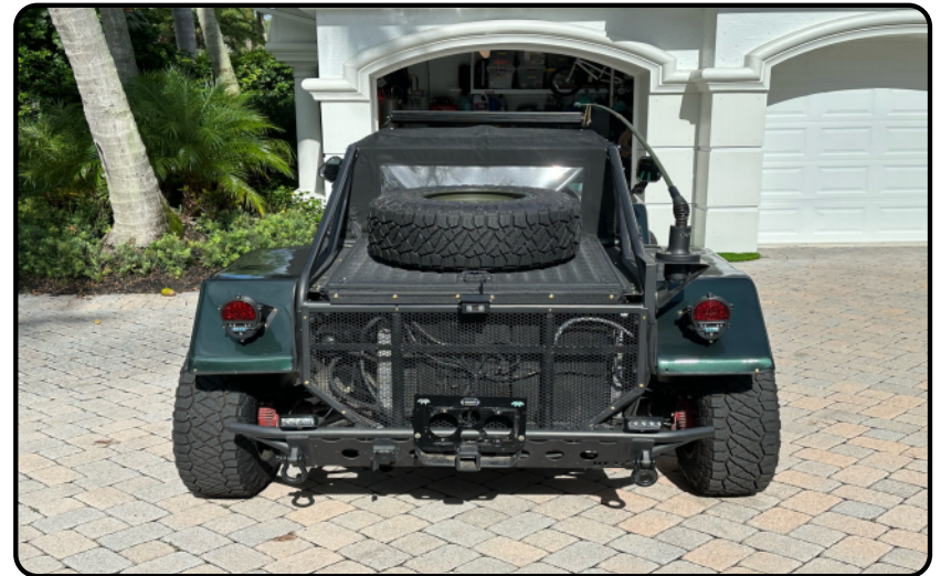
Photo: Rear of Car