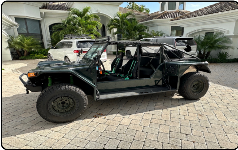
Photo: Driver Side of Car