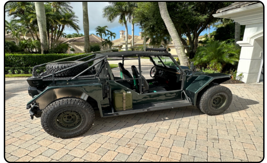
Photo: Passenger Side of Car