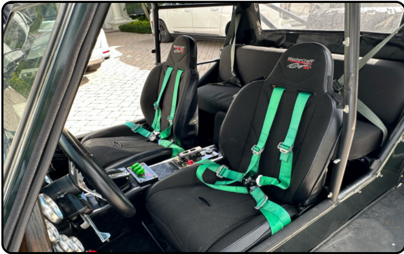
Photo: Front Interior Seats