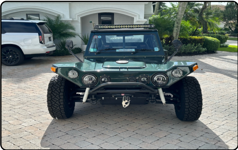
Photo: Front of Car