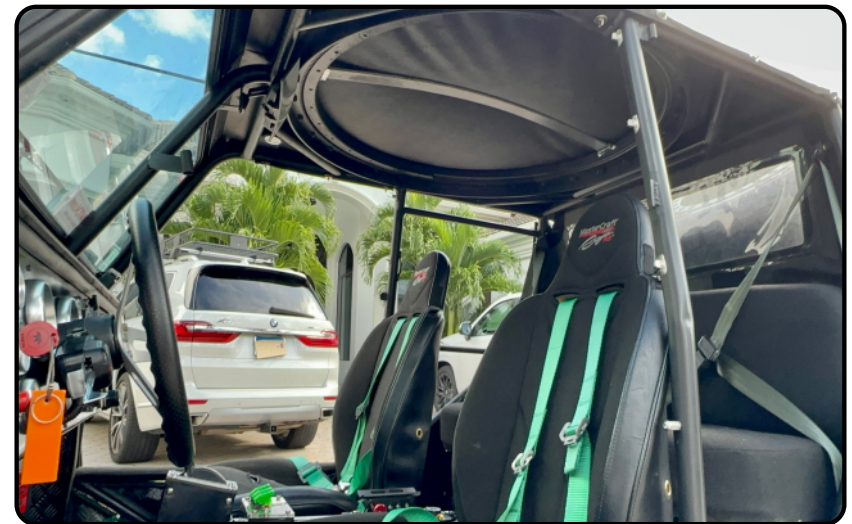
Photo: Gun Turret Left Installed