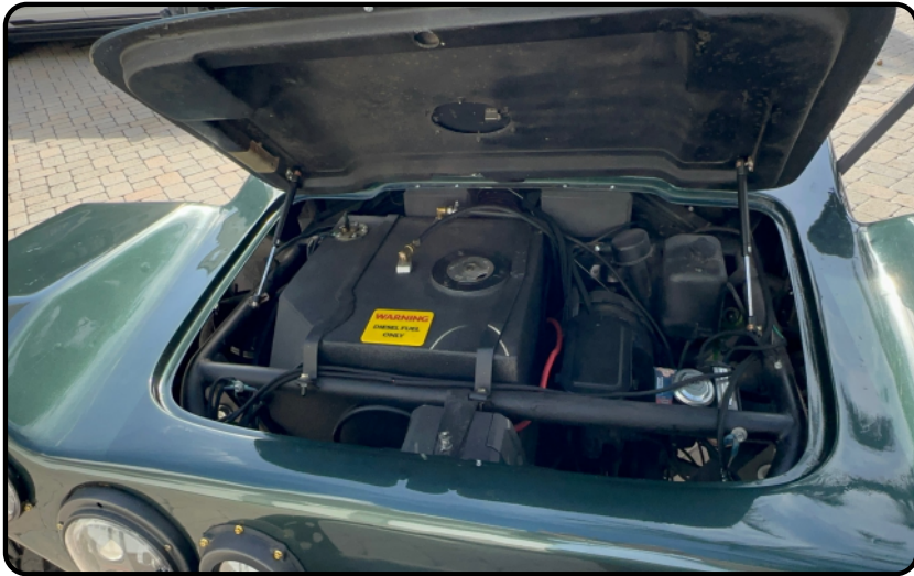
Photo: Under Front Hood