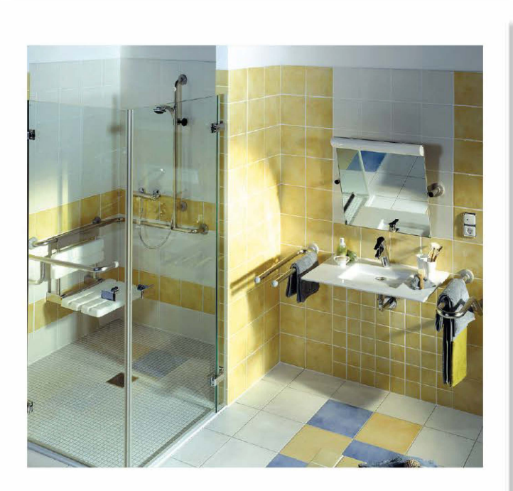
unimpeded bath accesories