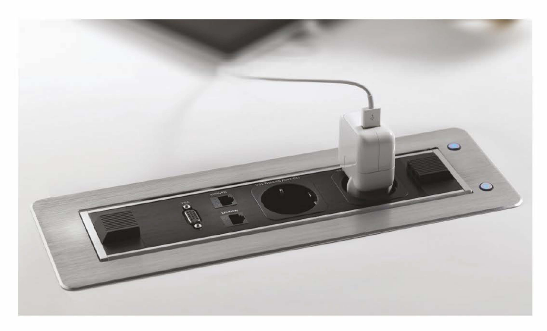
Wall plug on table