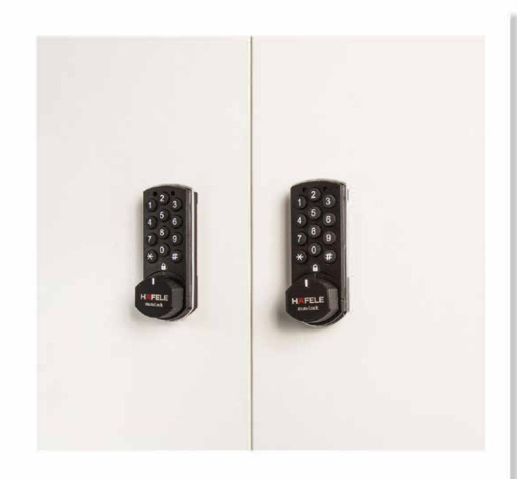
Minilock locker locking system