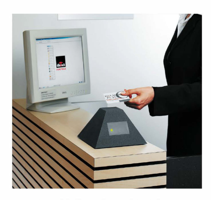
Administration soft ware integration