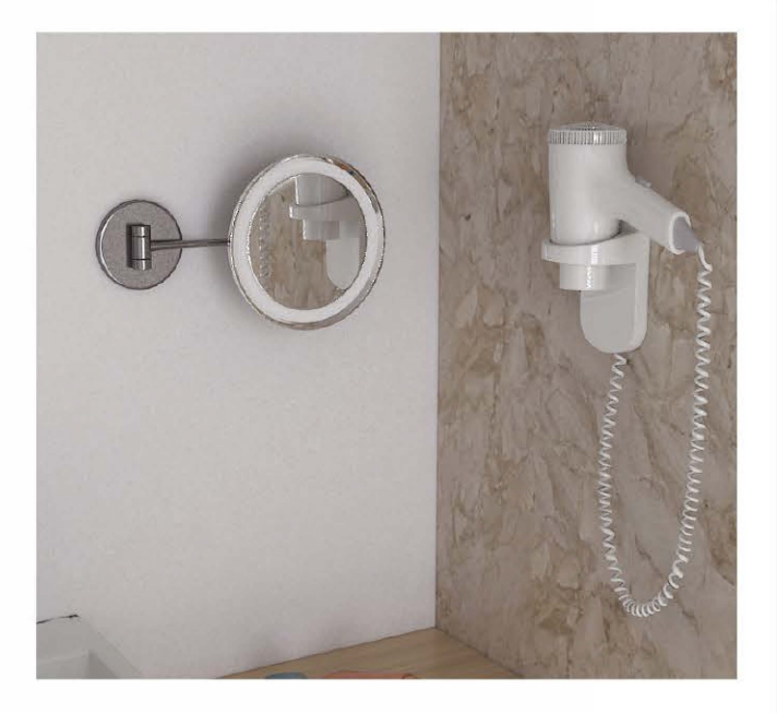
Wanify mirror and hair dryer