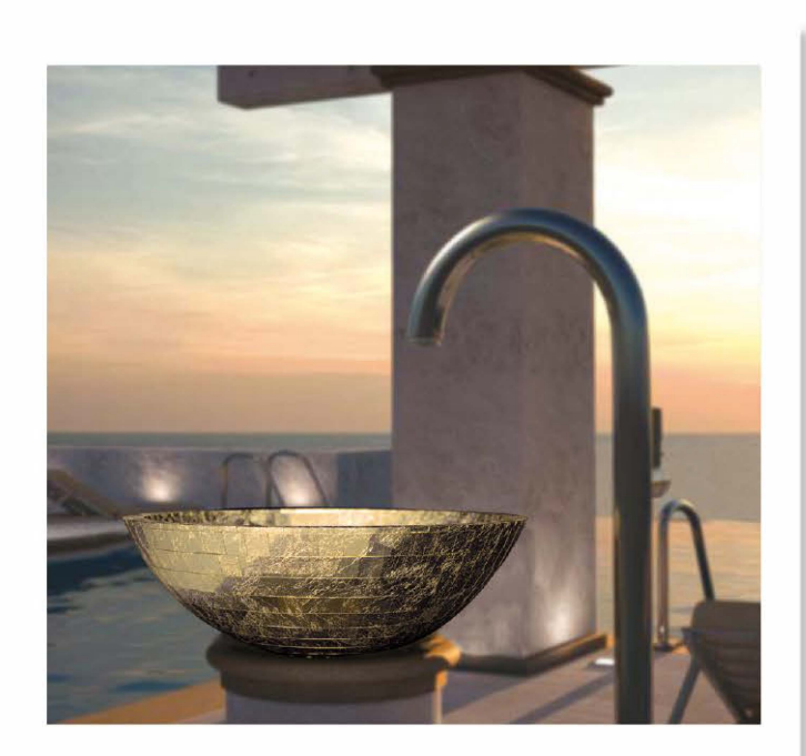
Special sink and armature