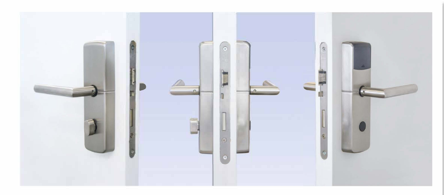
Dialock elektronic locking system