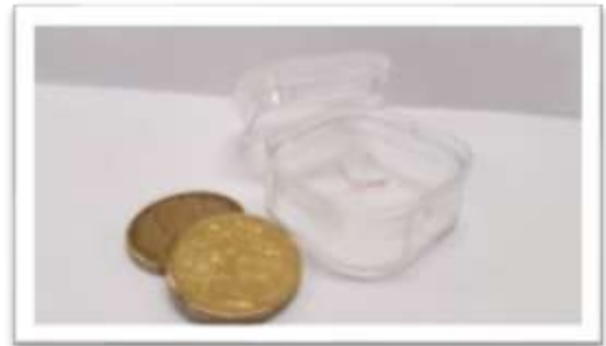
15 ZBLAN:Er 20 \mu\text{m} waveguides

We can either provide 'standard' configurations for those looking for proven geometries and compositions or explore custom variants to suit specialty needs.