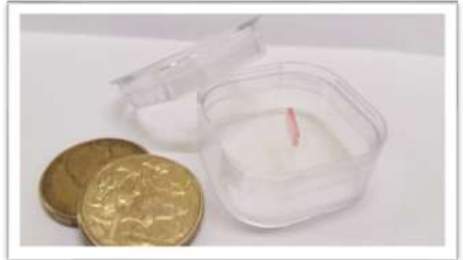
Single ZBLAN:Ho 20 \mu\text{m} waveguide

RedChip ZBLAN Waveguide Chips are suitable for compact SWIR laser development applications.