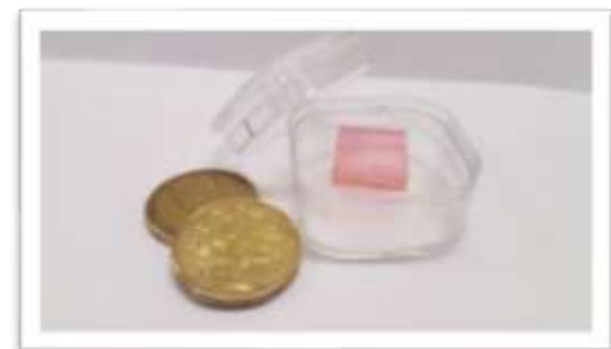
22 ZBLAN:Ho 30 \mu\text{m} waveguides

Please contact our RedChip waveguide writing experts at info@redchipphotonics.com to discuss how our capabilities can be applied to your needs.