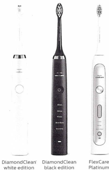
DiamondClean ® white edition