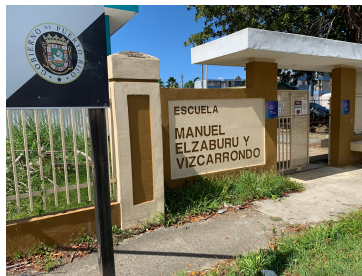
A few slots remaining!

Preparations are under way for our return service trip to Puerto Rico in March 2023. Join us and work in the community of Cantera, an under-served and densely populated neighborhood in San Juan. Working alongside our ground partner Instituto Nueva Escuela (INE) , a non-profit organization whose mission is bringing Montessori education to public schools and supporting the families of enrolled students, we anticipate offering projects in athletics, construction, education, environment, and public health. For more information consult the trip webpage .