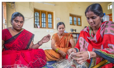
Local women making reusable pads

A New Opportunity with Amrita University Alumni