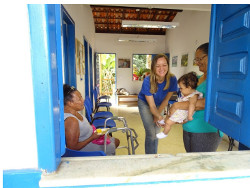
Residents of Serra Grande at Industria Tabôa