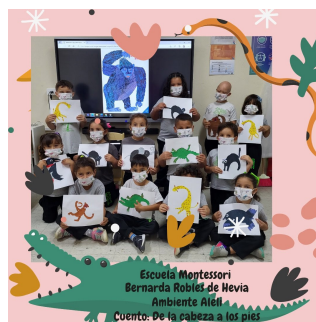
Kindergartners from San Juan