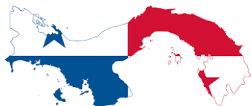
Stay tuned for updates in 2023!