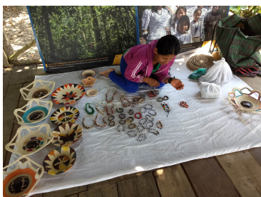
Give the gift of travel this holiday season!