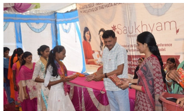
Saukhyam Resuable Pads

YASC is delighted to announce Our Common Future , a collaborative effort with Amrita University alumni to develop and organize unique virtual service projects for Amrita alumni-led NGOs and under-served communities in India. We will celebrate our partnership and develop virtual mentoring, sharing, learning, and social opportunities for the YASC-Amrita alumni community on January 21 at 11 a.m. EST . During the participatory session, you will hear about ways that Yale alumni can work with Amrita alumni and students in business consulting and mentoring, education: virtual book clubs and teacher to teacher interactions, women's empowerment and gender equality, healthcare for the poor, and other areas you suggest.