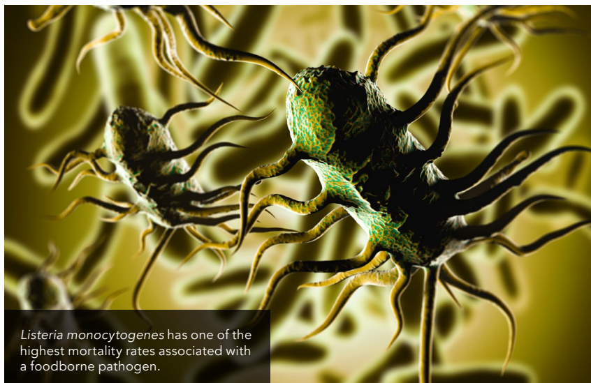
Listeria monocytogenes has one of the highest mortality rates associated with a foodborne pathogen.