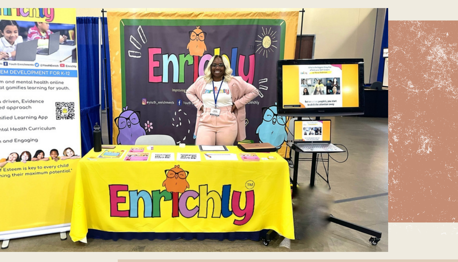
Texas as Bronze Sponsor at Texas PTA Launch 2022

Self-neglect, violent behavior and suicide have one thing in common amongst youth, and that's unhealthy self-esteem. 100 million children around the world suffer from low selfesteem.