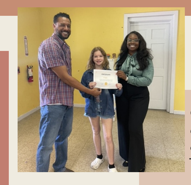
CEO and COO recognize students with certificates of completion of Self-esteem program