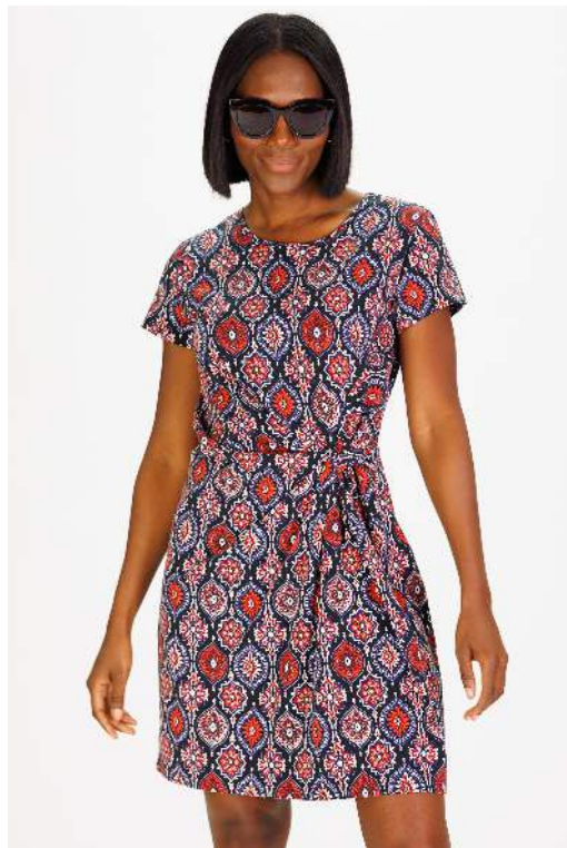
CARLY DRESS Medallion Print W$78 Signature Stretch Cotton