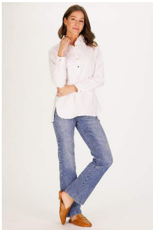
SAVANNAH TUNIC White Oxford W$72 Curated Collection