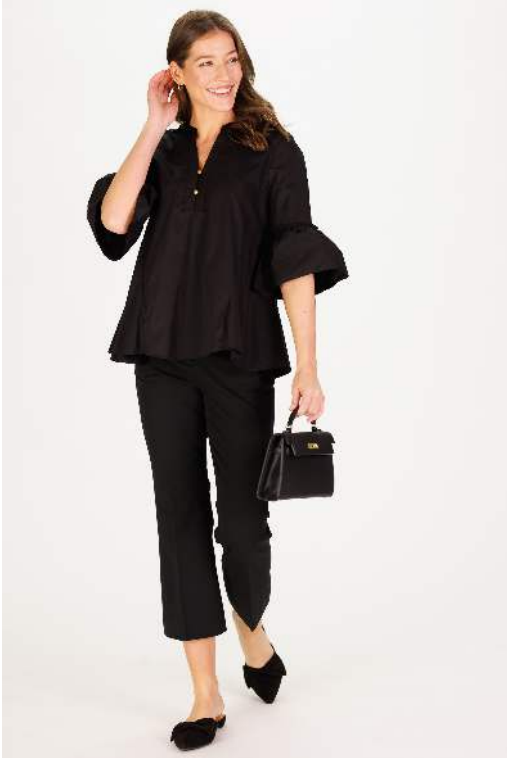
MELODY TOP Black W$99 Signature Stretch Cotton