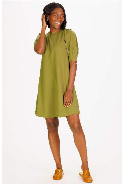
JENNIFER DRESS Moss Green W$69 Signature Stretch Cotton