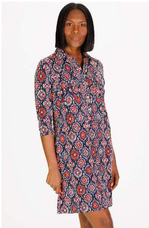
COCO DRESS Medallion Print W$89 Signature Stretch Cotton