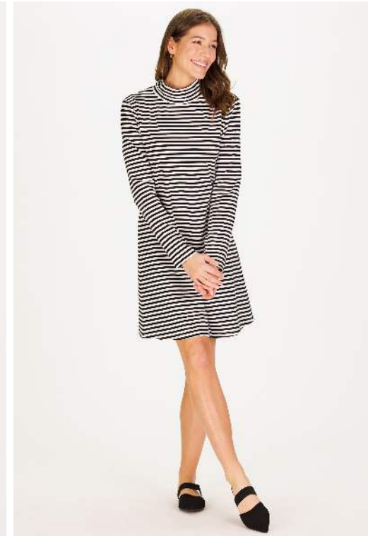
TABBY DRESS Black & White Stripe W$82 SuperSoft