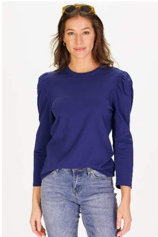
LYNN TOP Royal Navy W$47 Classic Cotton