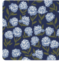
TOWNES DRESS Blue Wildflower Print W$96 Stretch Cotton

This delicate floral pattern showcases charming blossoms of an adorable light blue flower and vibrant green leaves that create a striking contrast against the deep navy background.