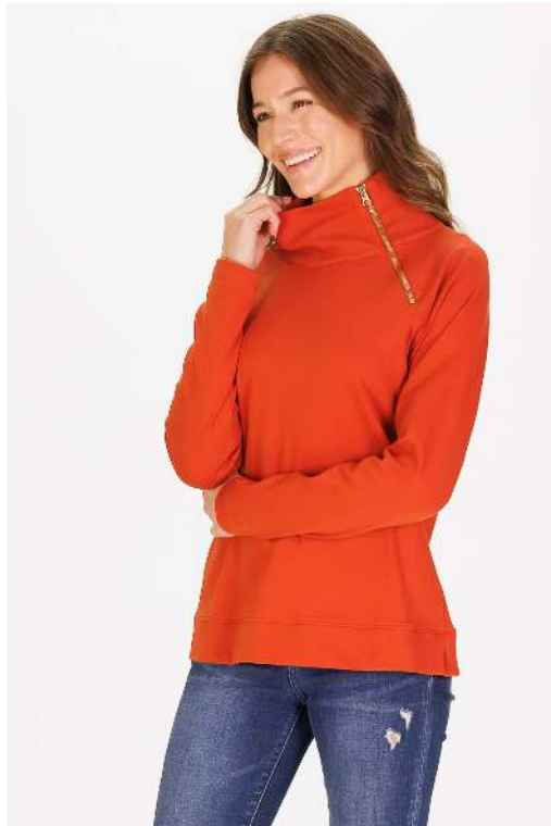
THE BOWEN Baked Apple W$73 Lux Interlock