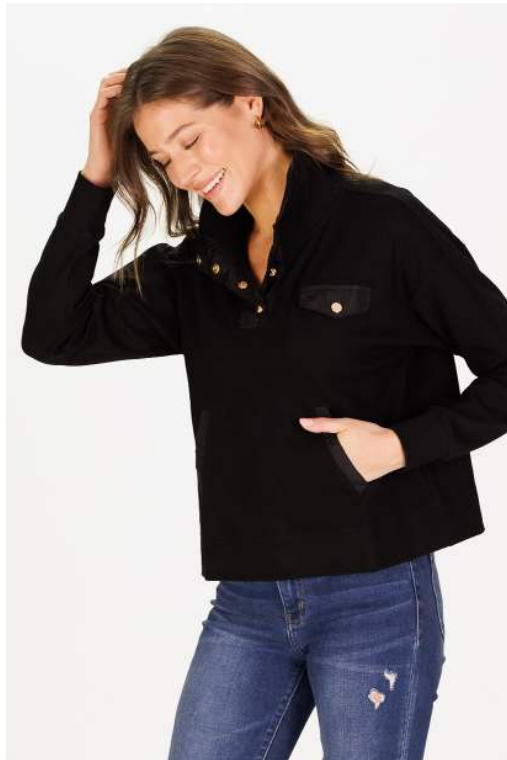
THE KENDALL Black W$73 Lux Interlock