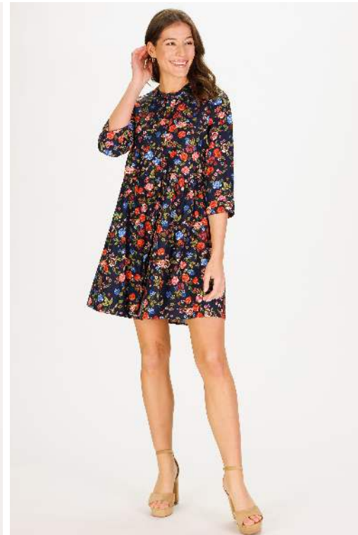
FARAH DRESS Midnight Garden Twill W$89 Curated Collection