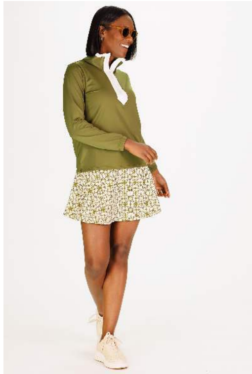
ACTIVE TORY QUARTER ZIP Moss Green W$69 Solar Stretch