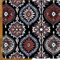
KATIE DRESS Medallion Print W$96 Stretch Cotton

This delicate floral pattern showcases charming blossoms of an adorable light blue flower and vibrant green leaves that create a striking contrast against the deep navy background.