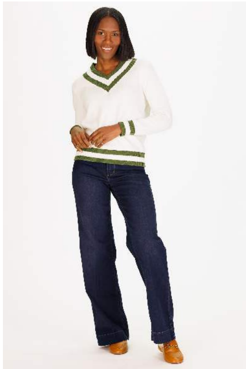
RELAXED V NECK VARSITY SWEATER Ivory/Moss Green W$78 Heirloom Cotton Sweater