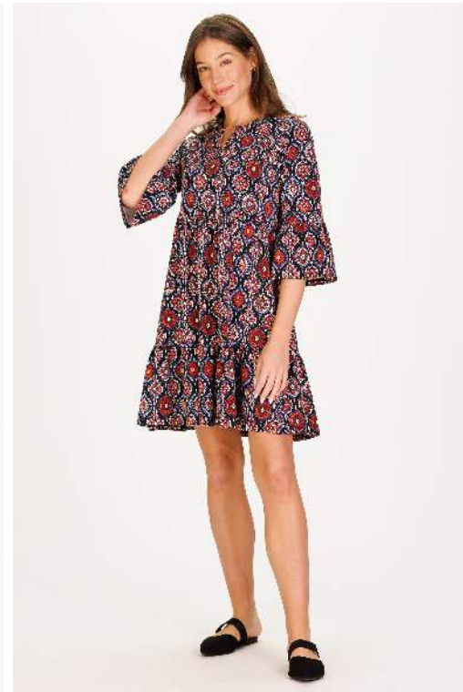
CAROLINE DRESS Medallion Print W$86 Signature Stretch Cotton