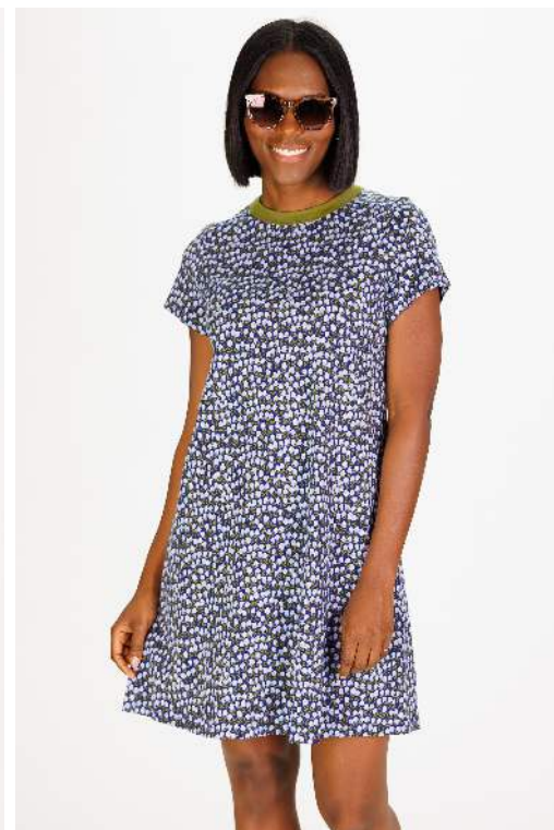
TALLIE TSHIRT DRESS Blue Wildflower Print W$74 Classic Cotton