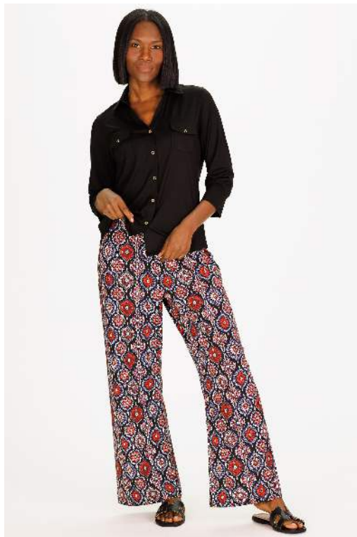
SOLAR STRETCH BIRDIE TOP Black W$72 Solar Stretch PERI PANT Medallion Pant W$64 Solar Stretch