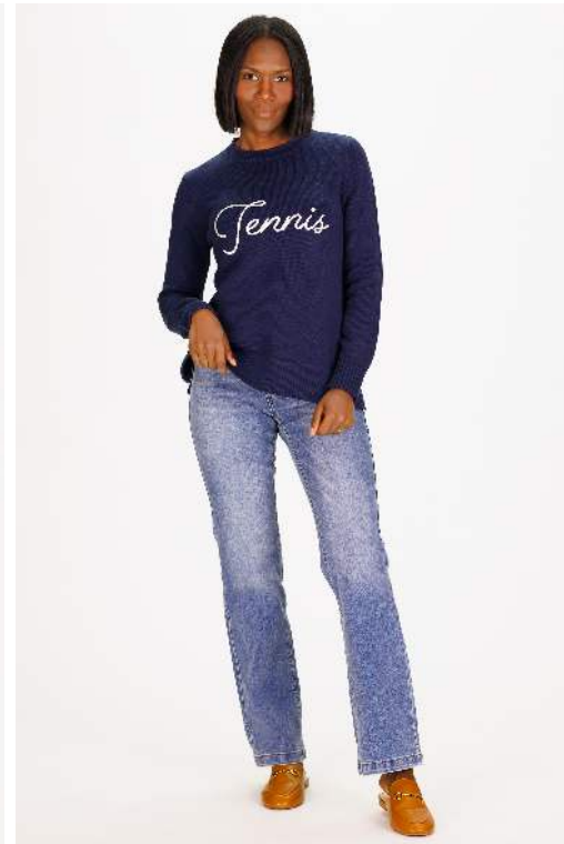
CASUAL CREW NECK SWEATER Navy/Ivory "Tennis" W$99 Heirloom Cotton Sweater