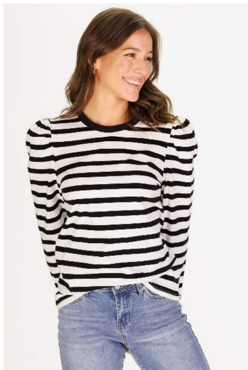
LYNN TOP Black & White Stripe W$47 Classic Cotton