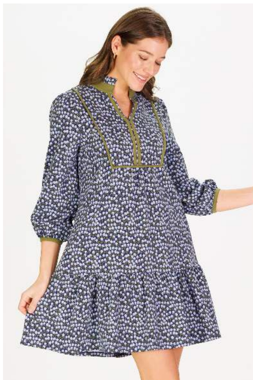
KATIE DRESS Blue Wildflower Print W$83 Signature Stretch Cotton