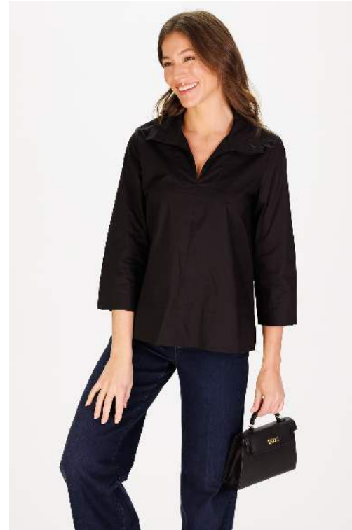
ADALINE TOP TOP Black Stretch Cotton Poplin W$74 Curated Collection

Picture the softest thing you've ever touched—now imagine wearing it. That's the sensation our super-soft fabric provides. Despite its cloud-like feel, this fabric offers a whisper-light warmth that's perfect for all seasons. It's the ideal companion for chilly evenings or crisp mornings, giving you that extra touch of snug without the bulk. Now in a fall classic Black and White Stripe!