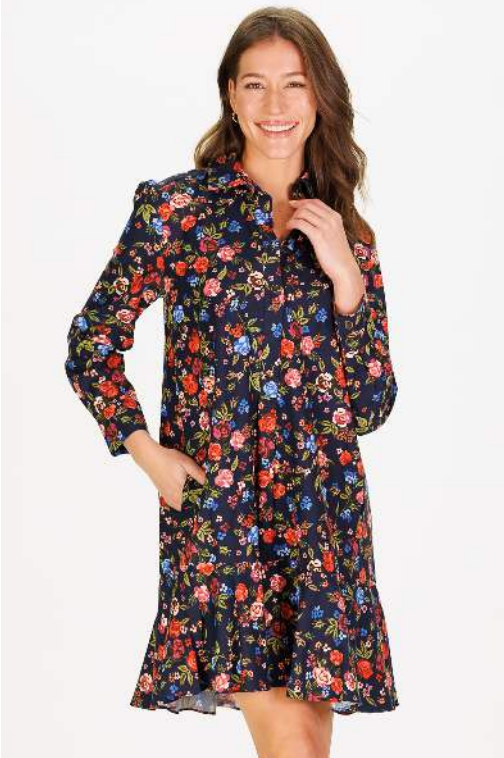
IRIS DRESS Midnight Garden Twill W$86 Signature Stretch Cotton