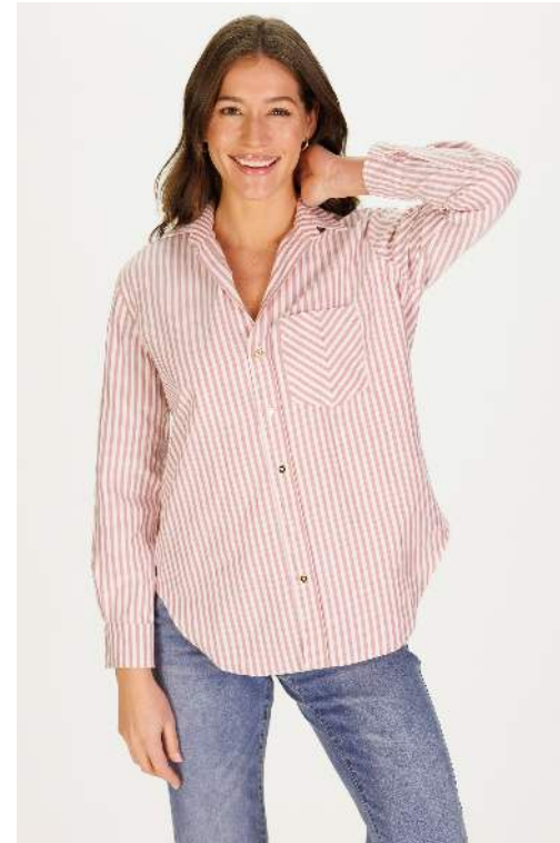
BOBBI BUTTON DOWN Baked Apple Stripe W$72 Curated Collection

Introducing our exquisite Ultra Soft Oxford Fabric – a perfect harmony of timeless style and unparalleled comfort! From the carefully selected fibers to the expertly applied softening process, our Ultra Soft Oxford Fabric is a testament to our commitment to quality craftsmanship and unparalleled comfort.