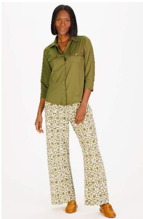
SOLAR STRETCH BIRDIE TOP Moss Green W$72 Solar Stretch