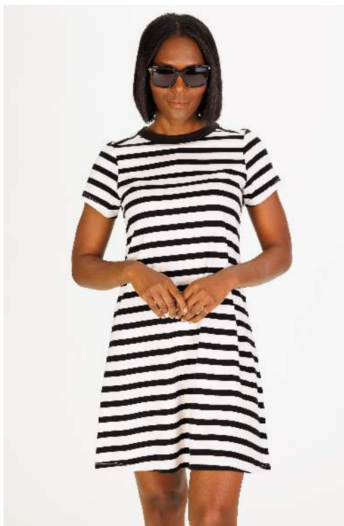
TALLIE TSHIRT DRESS Black & White Stripe W$65 Classic Cotton