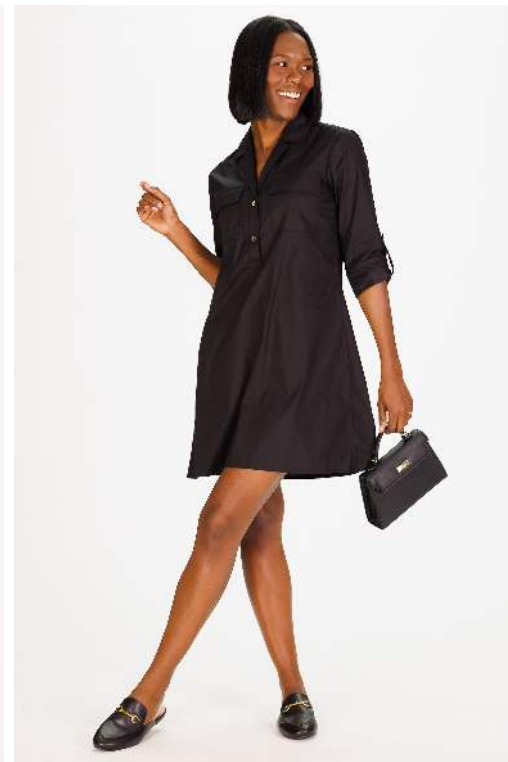
CARSON DRESS Black Stretch Cotton Poplin W$82 Curated Collection