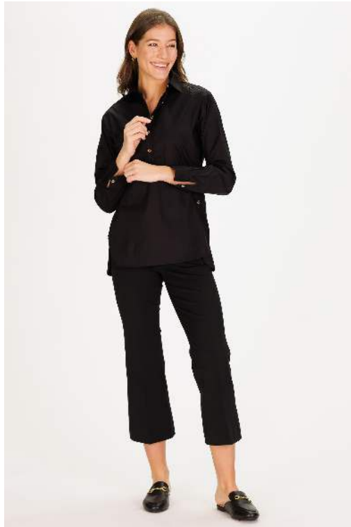
SAVANNAH TUNIC Black Stretch Cotton Poplin W$72 Curated Collection