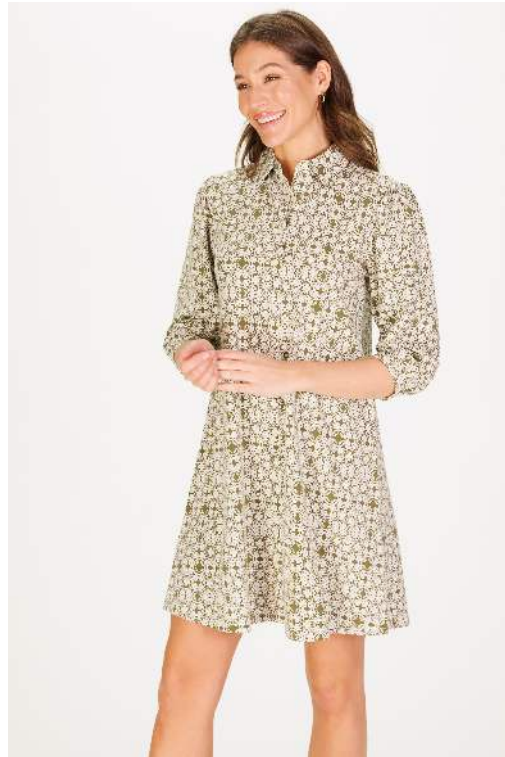
ASHLYNN DRESS Green Tile Print W$86 Signature Stretch Cotton