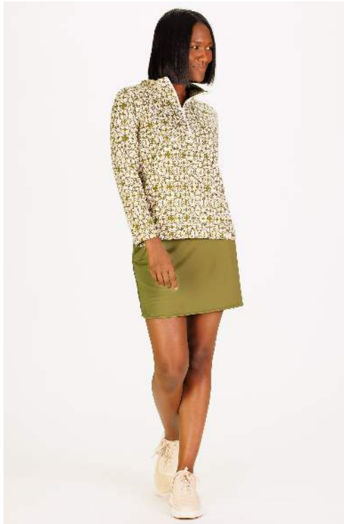
EVERETT QUARTER ZIP Green Tile Print W$69 Solar Stretch