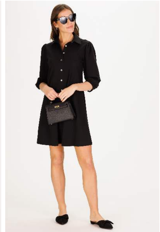
ASHLYNN DRESS Blue Blossom Feather W$99 Signature Stretch Cotton