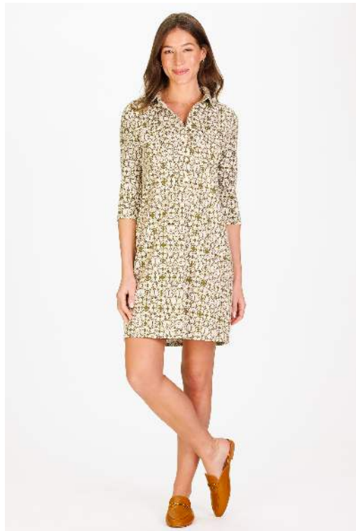
COCO DRESS Green Tile Print W$89 Signature Stretch Cotton