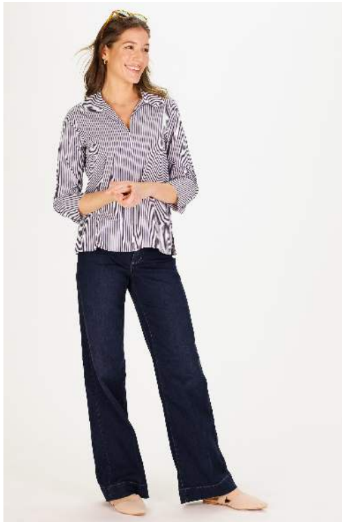
ADALINE TOP Navy & White Poplin Stripe W$72 Curated Collection