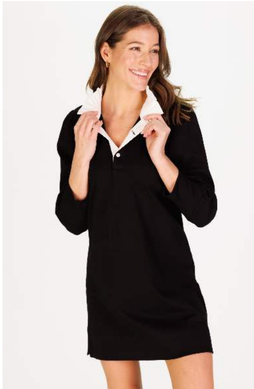
ADLER DRESS Black W$82 Lux Interlock