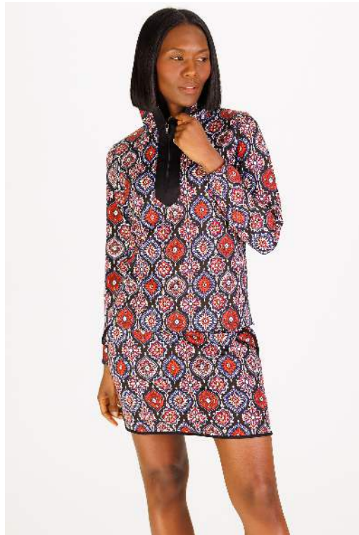
ACTIVE TORY QUARTER ZIP Medallion Print W$69 Solar Stretch