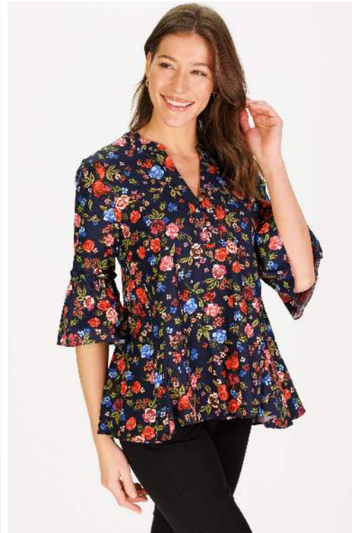
MELODY TOP Midnight Garden Twill W$74 Curated Collection