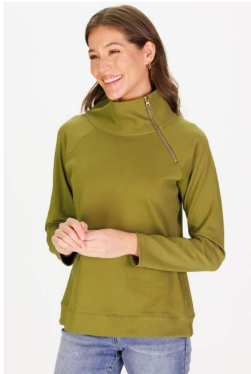
THE BOWEN Moss Green W$73 Lux Interlock