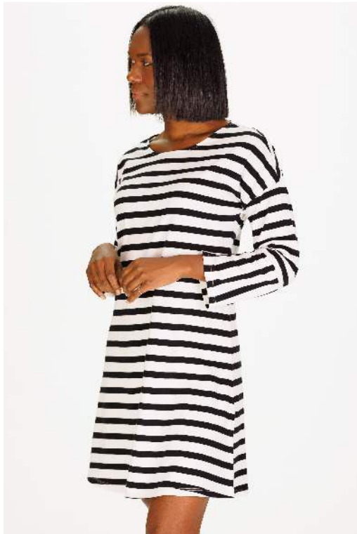
NICOLE DRESS Blue Blossom Feather W$99 Signature Stretch Cotton