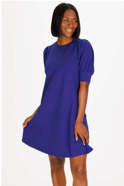
JENNIFER DRESS Royal Navy W$69 Signature Stretch Cotton