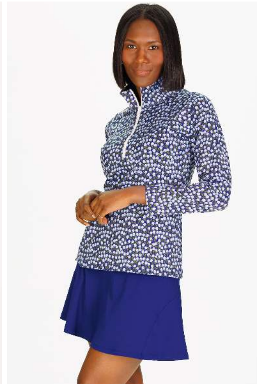
EVERETT QUARTER ZIP Blue Wildflower Print W$69 Solar Stretch