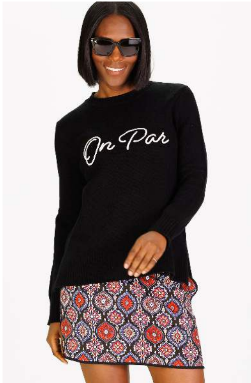
CASUAL CREW NECK SWEATER Black/Ivory "On Par" W$78 Heirloom Cotton Sweater