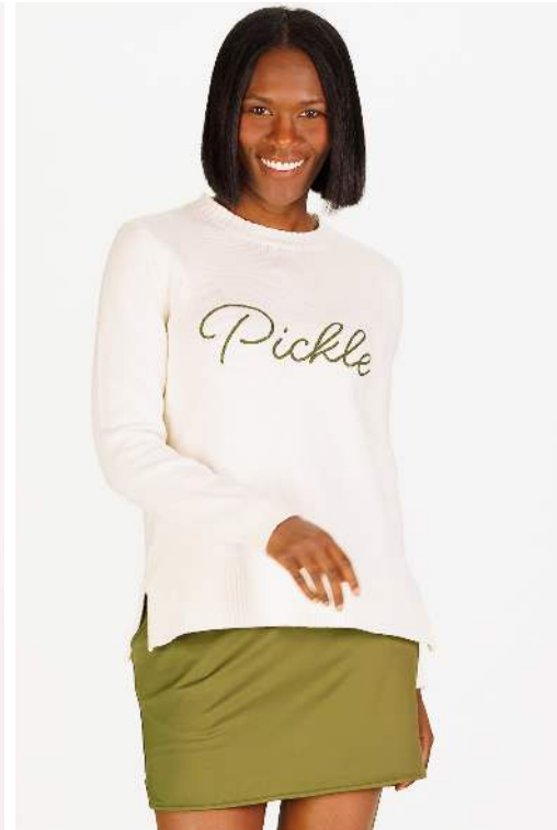
CASUAL CREW NECK SWEATER Ivory/Moss Green Pickle W$78 Heirloom Cotton Sweater