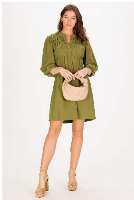
HYACINTH DRESS Moss Green W$99 Signature Stretch Cotton