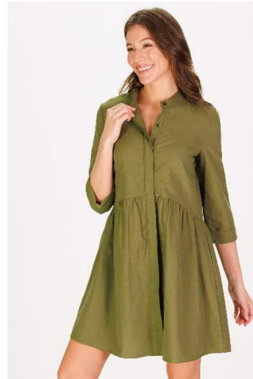
FARAH DRESS Moss Green Oxford W$89 Curated Collection