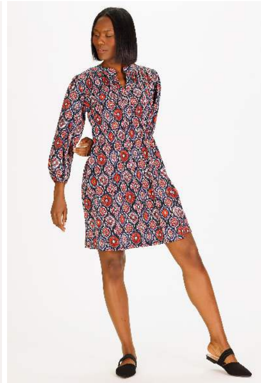
HYACINTH DRESS Medallion Print W$83 Signature Stretch Cotton