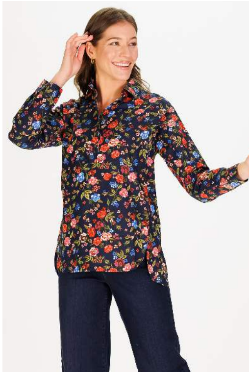
SAVANNAH TUNIC Midnight Garden Twill W$72 Curated Collection

Our Midnight Garden twill is a luxurious and substantial cotton woven fabric that seamlessly marries comfort with sophistication. The twill weave imparts a subtle diagonal texture to the fabric, adding depth and dimension to the floral design. The deep, inky midnight shade serves as a backdrop to a vibrant and captivating botanical motif.