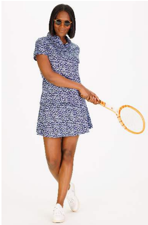
LORNA POLO TOP Blue Wildflower Print W$56 Solar Stretch