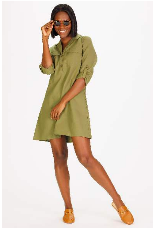
CARSON DRESS Moss Green W$82 Curated Collection