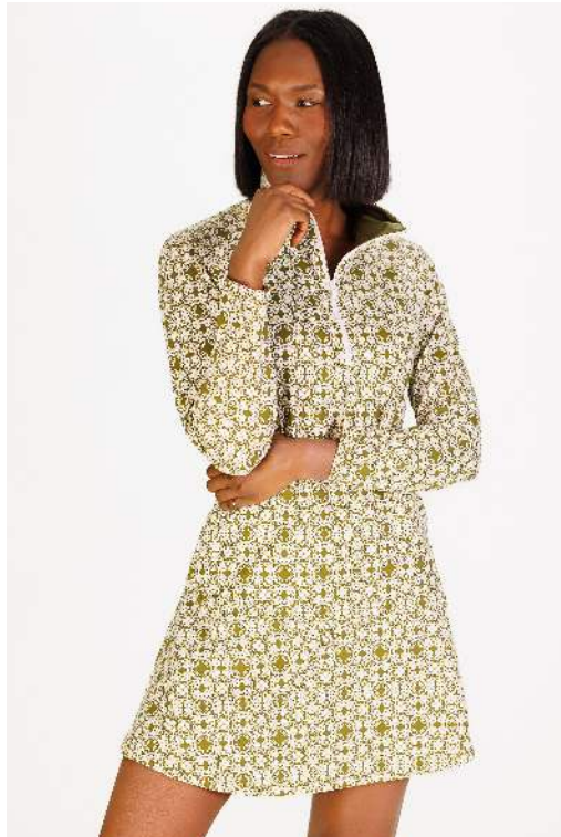
EVERETT QUARTER ZIP Green Tile Print W$69 Solar Stretch