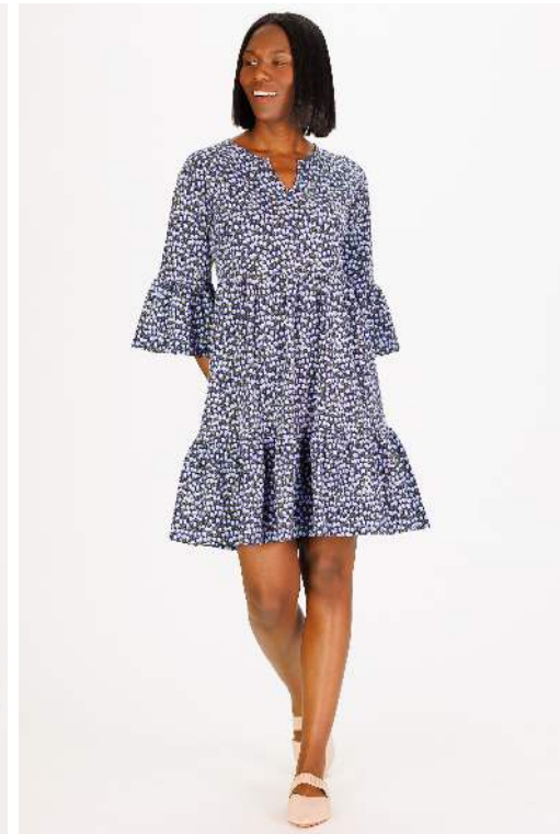
CAROLINE DRESS Blue Wildflower Print W$86 Signature Stretch Cotton