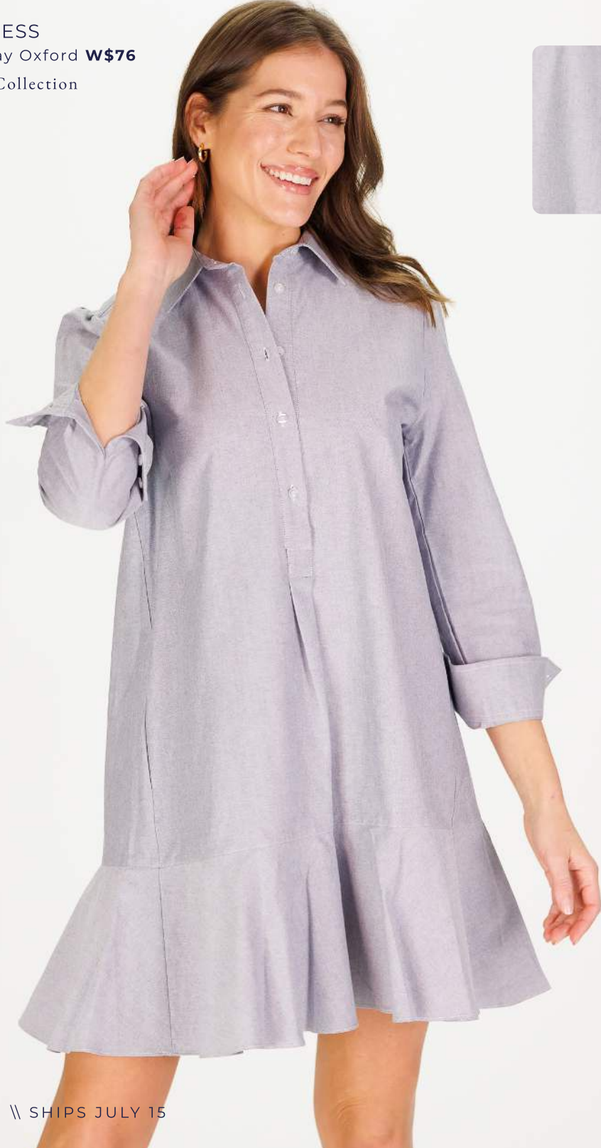
IRIS DRESS Chambray Oxford W$76 Curated Collection