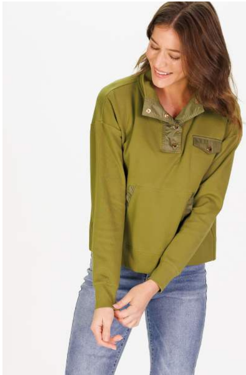
THE KENDALL Moss Green W$73 Lux Interlock