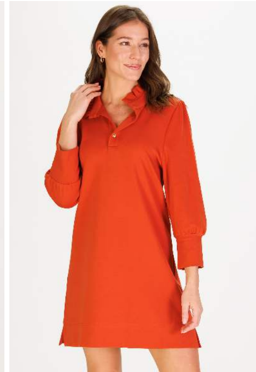
ADLER DRESS Baked Apple W$82 Lux Interlock