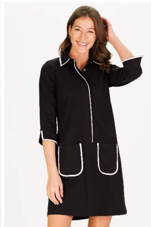
TOWNES DRESS Black W$89 Signature Stretch Cotton