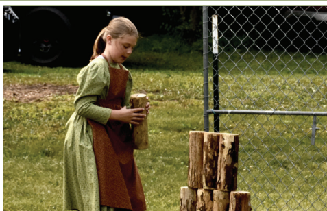
Young Historian's Ball Game