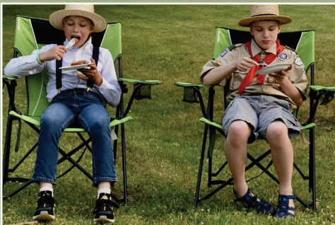
Young Volunteers Enjoying the Pie

We had an awesome event thanks to our guests, donors and outstanding volunteers!