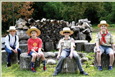
Young Historians Taking a Break