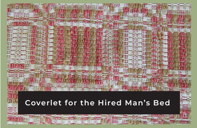
Coverlet for the Hired Man's Bed