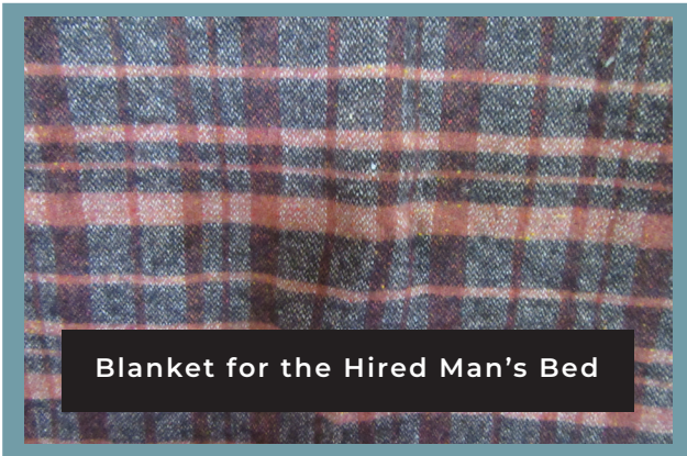
Blanket for the Hired Man's Bed