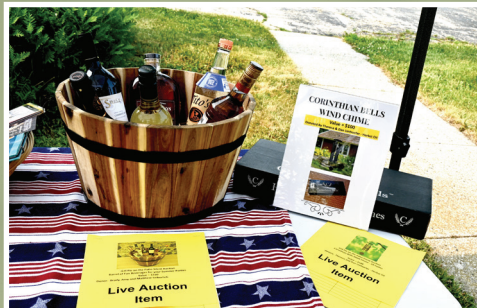
Unique Auction Items