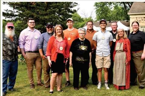
JCH Board & Staff Members