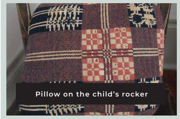
Pillow on the child's rocker