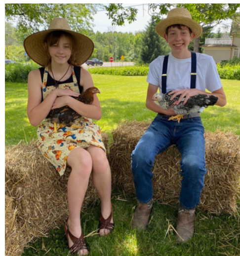
4-H Club volunteers and their chickens

And as always, we are open for special appointments and tours this summer. Contact us at: info@jonathanclarkhouse.org