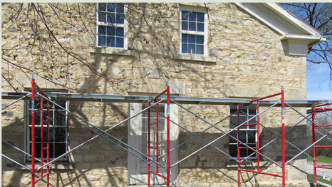
Mid-April, 2025, and work has already begun on some of the Jonathan Clark House exterior preservation projects.

The Friends of the Jonathan Clark House Board of Directors have embarked on a comprehensive preservation plan. The goal of the plan's three current projects is to preserve and maintain the house's 1848 historical integrity, ensuring its longevity as a cultural landmark and educational resource for the community. Each project is essential for the physical upkeep of the building and for safeguarding our community's identity and heritage for future generations. The projects will enable the organization to continue to provide educational programming for the community, fostering a deeper understanding of local history and thus provide quality outreach and educational opportunities for youth and adults.