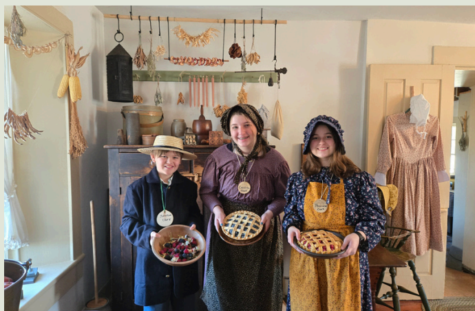
JCH Young Historians are ready for the Pie event

Mark your calendar for our annual “ Pie on the Patio ” event on Tuesday, June 10, from 5:00 until 7:00 PM . This very special event is a way to say “Thank you” to our Friends and donors. Plan to bring your family as well as a few friends who would enjoy a relaxing evening and an interactive museum tour. Your invitation is at the end of this newsletter.