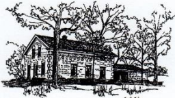
Jonathan M. Clark House - 1848 -

Your gift will enable the Friends of Jonathan Clark House to purchase and preserve a unique historic treasure for generations of children and adults.