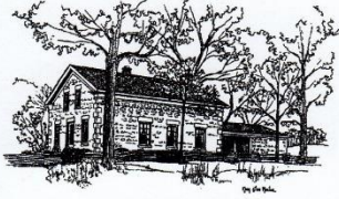
Jonathan M. Clark House - 1848 -