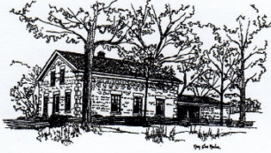
Jonathan M. Clark House - 1848 -