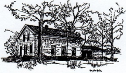
Jonathan M. Clark House - 1848 -

Your gift will enable the Friends of Jonathan Clark House to purchase and preserve a unique historic treasure for generations of children and adults.