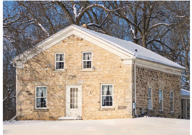
Jonathan Clark House, south facade in winter

Were your—or your neighbors'—ancestors among Mequon's first farmers? Come see our new, annotated, 1860 Mequon Plat Map and discover where Mequon's early settlers lived and learn details of how they farmed. Bring your favorite magnifier or use one of ours.