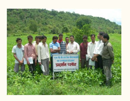
Farmers visit the NPV Demonstration plots