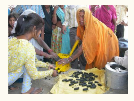
Training program on briquette preparation