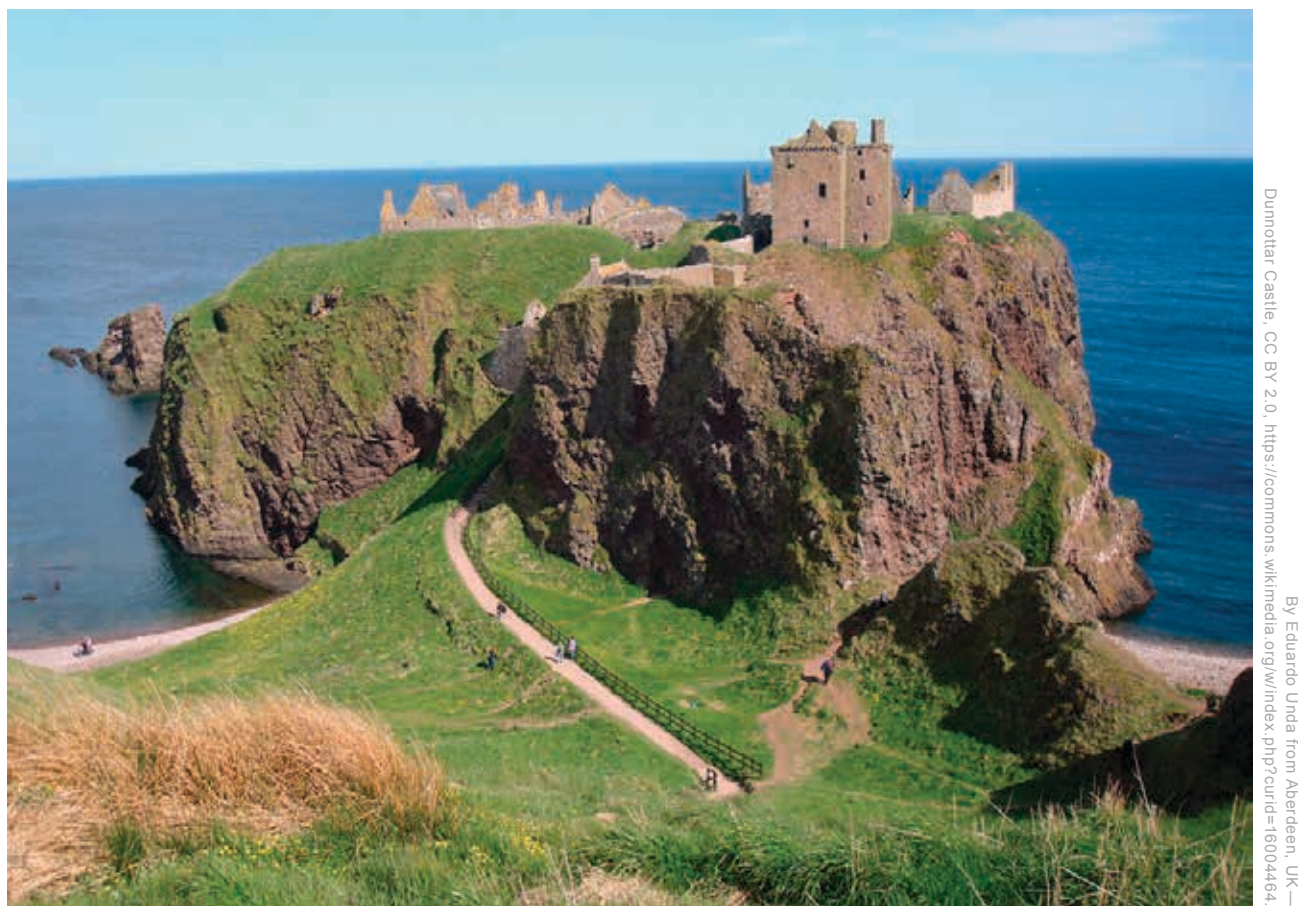
Dunnotar Castle, CC BY 2.0, https://commons.wikimedia.org/w/index.php?curid=16004464 . By Eduardo Unda from Aberdeen, UK —