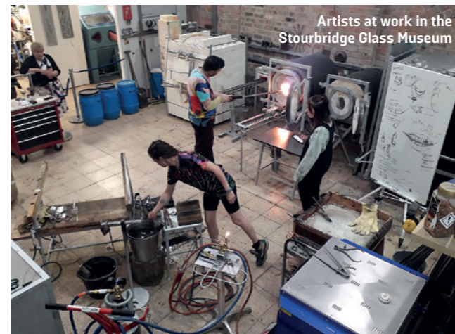
Artists at work in the Stourbridge Glass Museum