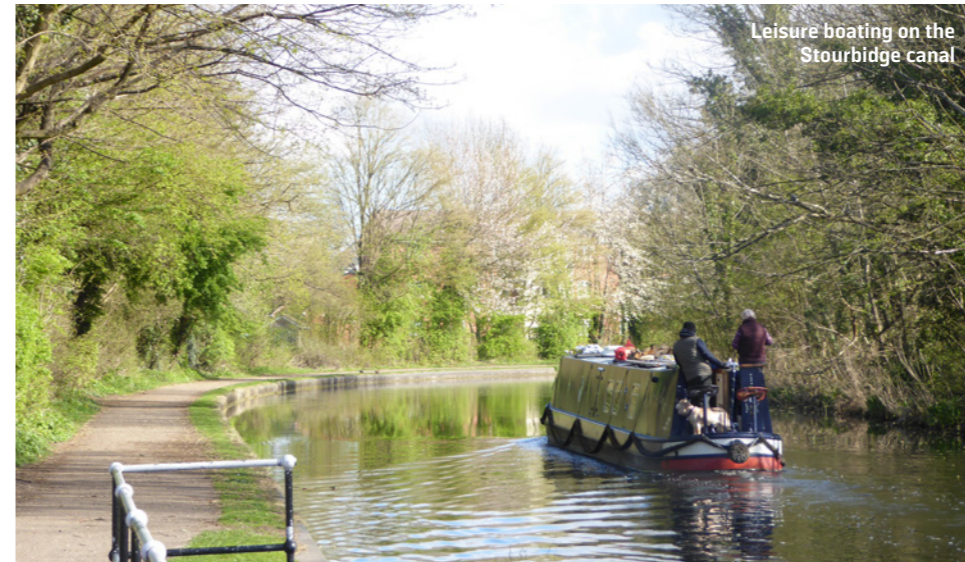
Leisure boating on the Stourbridge canal