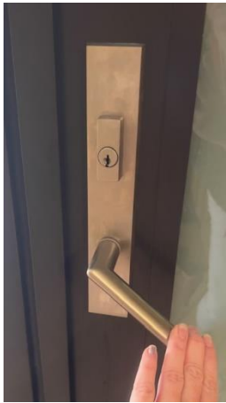
TO OPEN DOOR