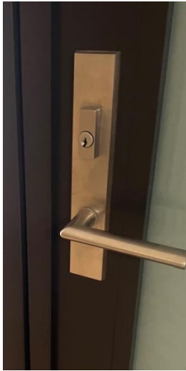
DOOR HANDLE IN REGULAR POSITION.

The door handle should ONLY be pressed downward for normal operation, unless you intend to engage the hurricane locking system during a hurricane!