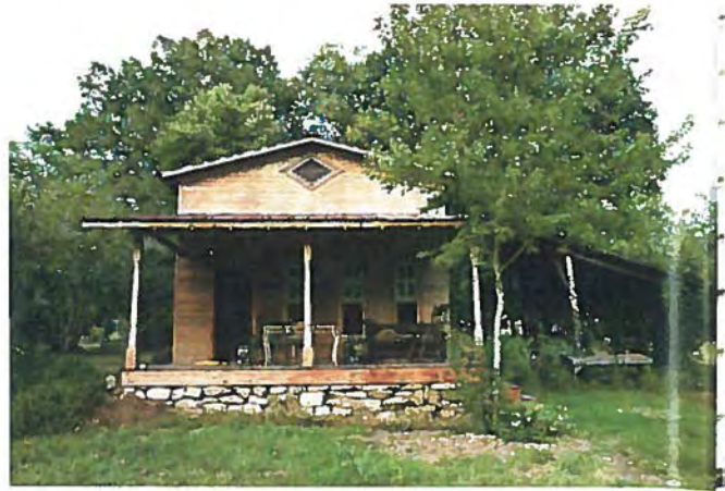
The LaGardes' studio and workspace is located in the expansive dairy barn (shown above) on their property near Snow Camp.