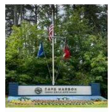
Figure 1 AQUALAND SIGN ON HILLSIDE