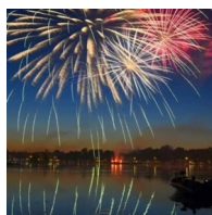
Fireworks Package- $225

Add a touch of class with a dedicated server who will set up, serve your guests, clear tables, package leftovers, and leave everything spotless. Leave the work to us and enjoy every moment!