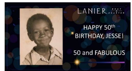
Figure SEQ Figure \* ARABIC 1Example of Welcome Slide

To create a welcome slide for your event, begin by following the same process used for the slideshow. However, this time, start from within the "Welcome Slide" folder and add just one photo. We will use your photo with the message you will provide during our planning session to create the slide. Corporate outings are encouraged to provide their logo for the Welcome Aboard Slide.