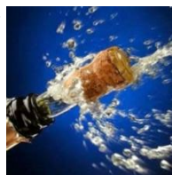
Champagne Toast -$50/p 10 guests

Additional hours may be pre-purchased for $490 per hour. $575 per hour if purchased 24 hours prior to or on same day as scheduled cruise.