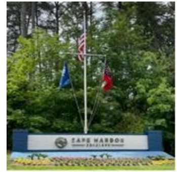
Figure 1 AQUALAND SIGN ON HILLSIDE

IMPORTANT: Our commercial dock (Q Dock) is a bustling area, with a mix of patron and business operations traffic. To ensure your safety, we kindly request you not to approach the dock. Please remain on land until our Captain meets with you directly. Failure to comply will delay the start time of the event.