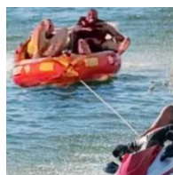
Jet Tubing- $225

Don't bother with the inconvenience of sourcing your own ice - purchase our service and let us take care of everything for you. We keep a stock of 100lbs in our deep freeze to ensure we always have enough on hand, leaving you with one less thing to worry about on your hot summer cruise. No need to lug around 50lbs of ice - let us do the driving and the heavy lifting.